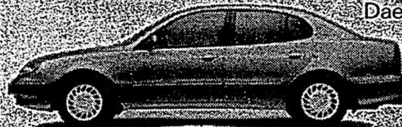
The Leganza starting at $20,295

Daewoo cars are designed by Giugiaro, Guigiaro of the internationally acclaimed ItalDesign studio. Their designs take high-tech aerodynamics, graceful elliptical styling and spacious interiors to new heights. From Germany, the powertrain is designed by former Porsche engineer, Dr. Ulrich Bez. And every vehicle features a Porsche-engineered chassis, as well as a Lotus-inspired suspension developed in Worthing, UK. Around the world, from the desert heat of Oman to the Arctic cold of Russia, each line of cars has been exhaustively tested in 15 countries for 20 continuous months. Here in North America, Daewoo cars have thrived - even in Canada's bitter winter conditions. And they have met and surpassed every North American safety standard for child protection, as well as front, rear and side impact.