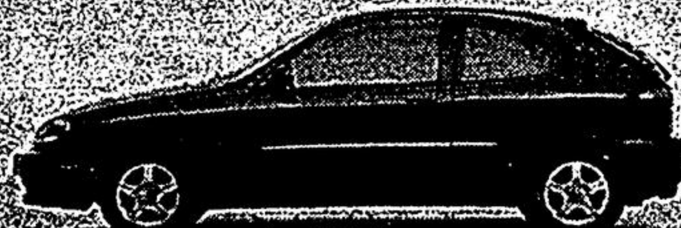
The Lanos starting at $12,495

Daewoo's New Fall "No Payments" Program Low Finance or Lease Rates