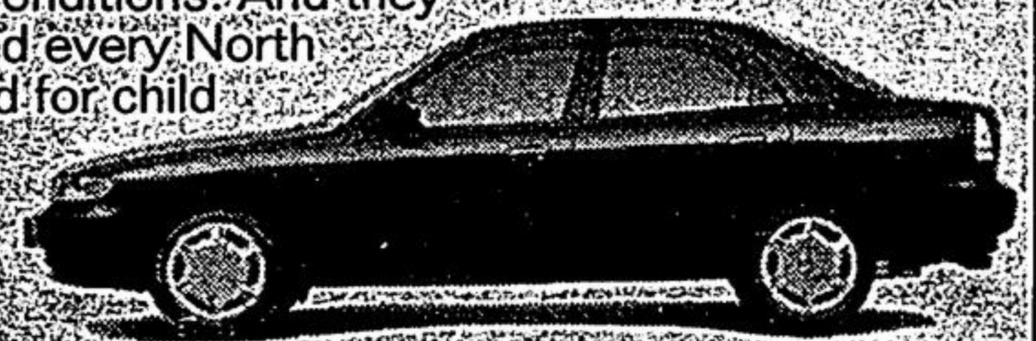
The Nubira starting at $16,295

In addition, Daewoo offers more standard features than other cars in its price range. When it comes to new-car value, the world is getting wiser.