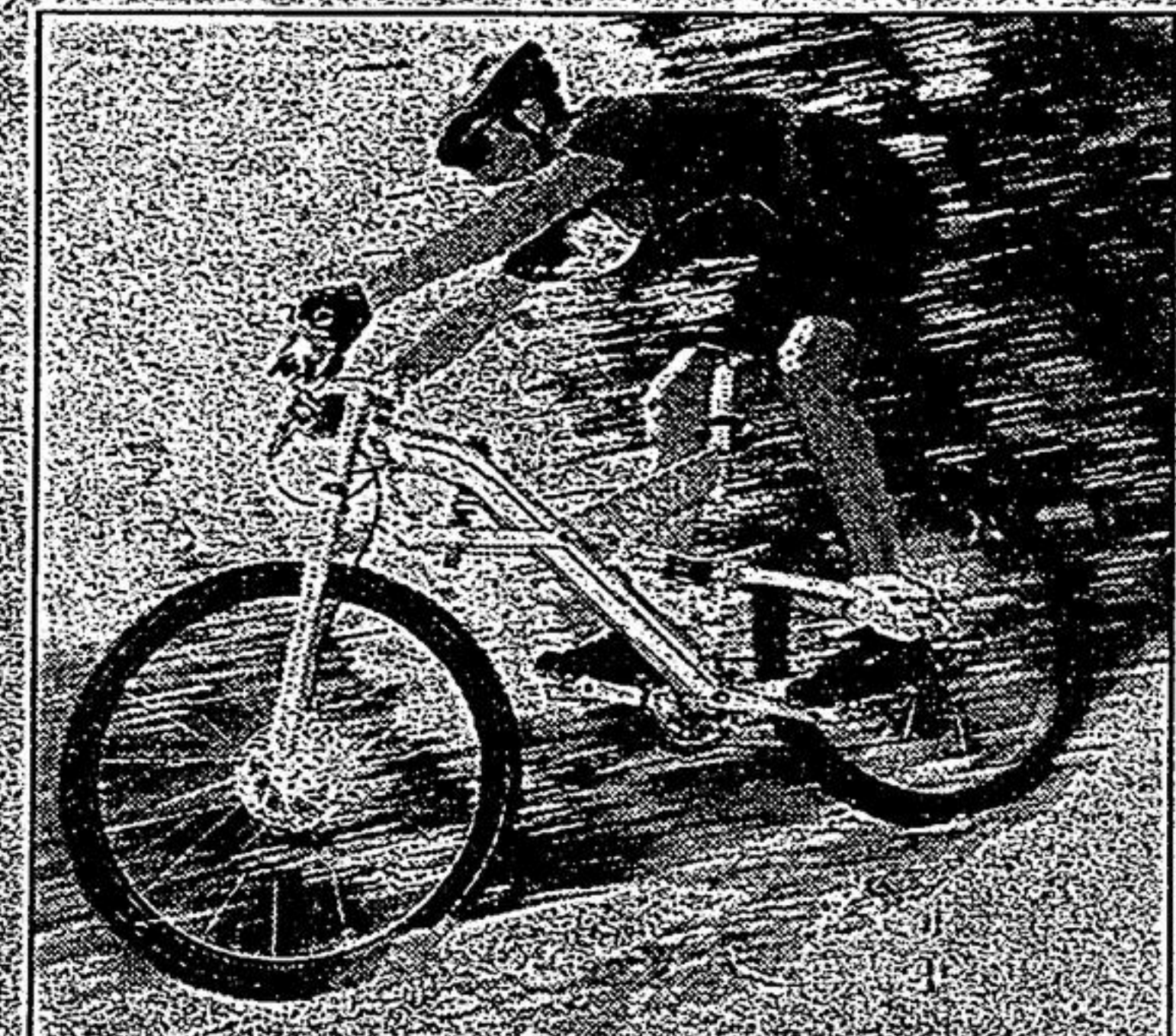
BMW is offering its third generation in high-tech mountain bike that can fold and fit into the trunk of any Bimmer.

BMW has been using this technology for a number of years also in the production of bicycles and remains the only manufacturer worldwide to offer this unique Telelever system combining extra safe-