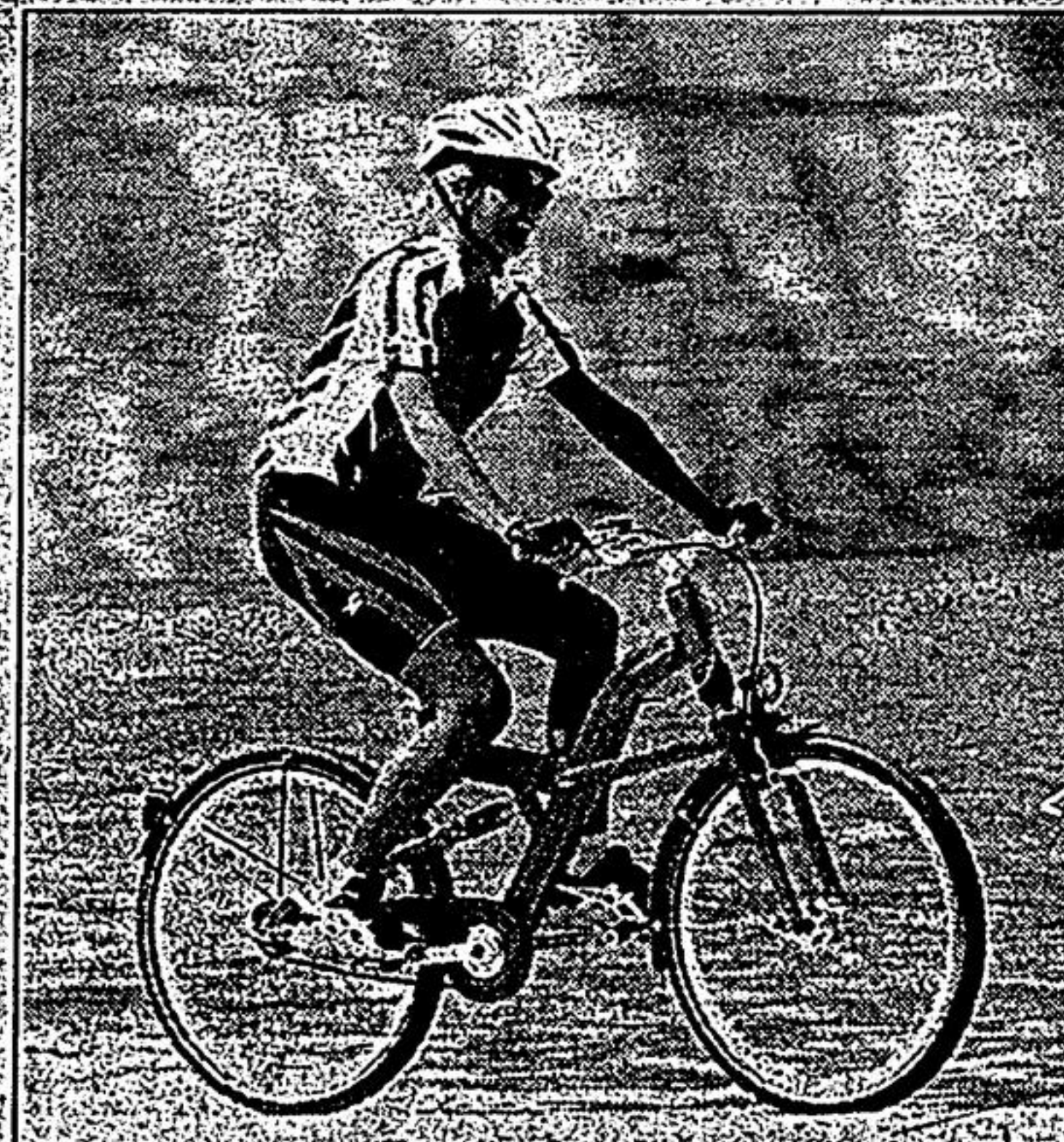
Touring bike by BMW.

Like all BMW trekking and mountain bikes, so far, the new Q Series bikes fold up conveniently, fitting into the luggage compartment of a standard car.