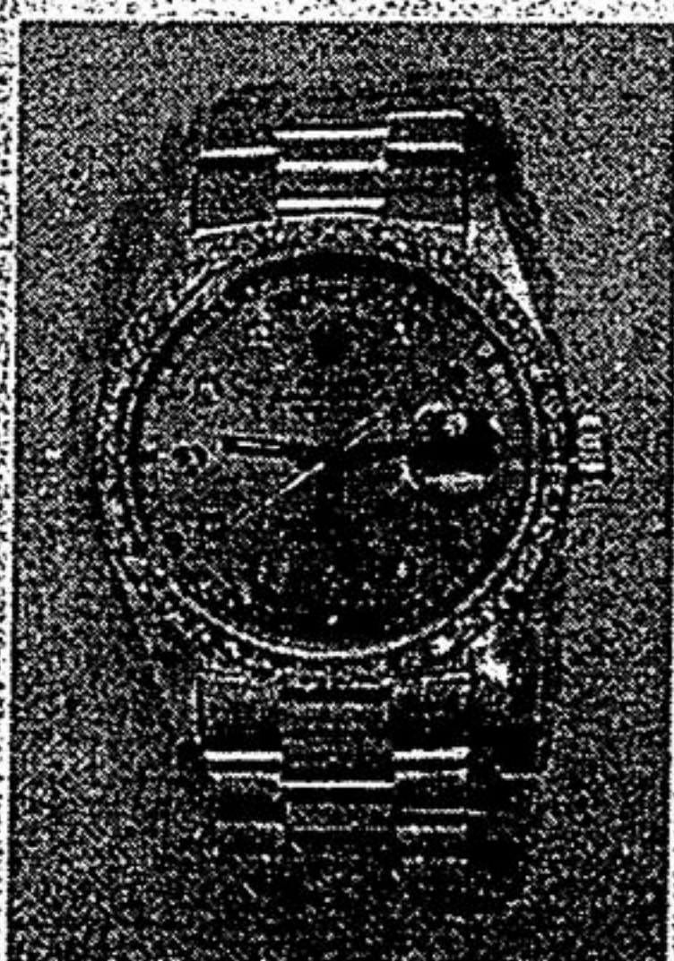
Gent's Rolex President with diamonds valued at $42,000.00

Over 200 fabulous items will be sold on the basis of NO MINIMUM, NO RESERVE BID