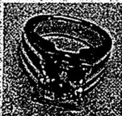
5.96 ct Princess cut solitaire on 18 kt white gold setting valued at $138,000.00

Large selection of Diamond Solitaires, Rings, Necklaces, Bracelets, Earrings, Emeralds, Rubies, Etc.