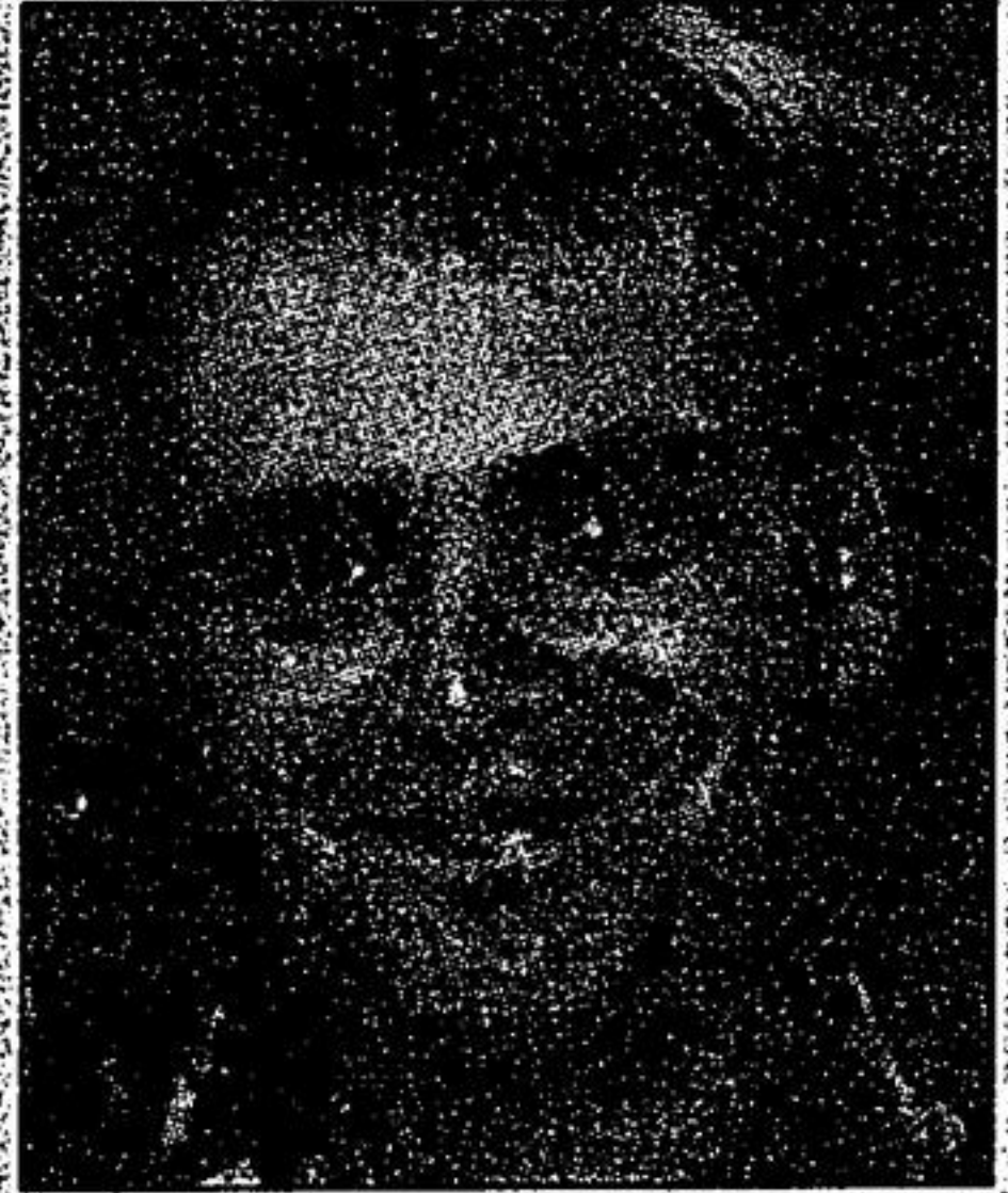
CURTIS JOSEPH: Grew up in Sharon watching Toronto Maple Leafs play on television.