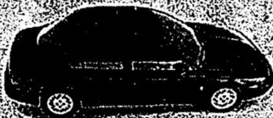
1999 Saturn SL1

includes auto a/c am/fm cassette plus much more