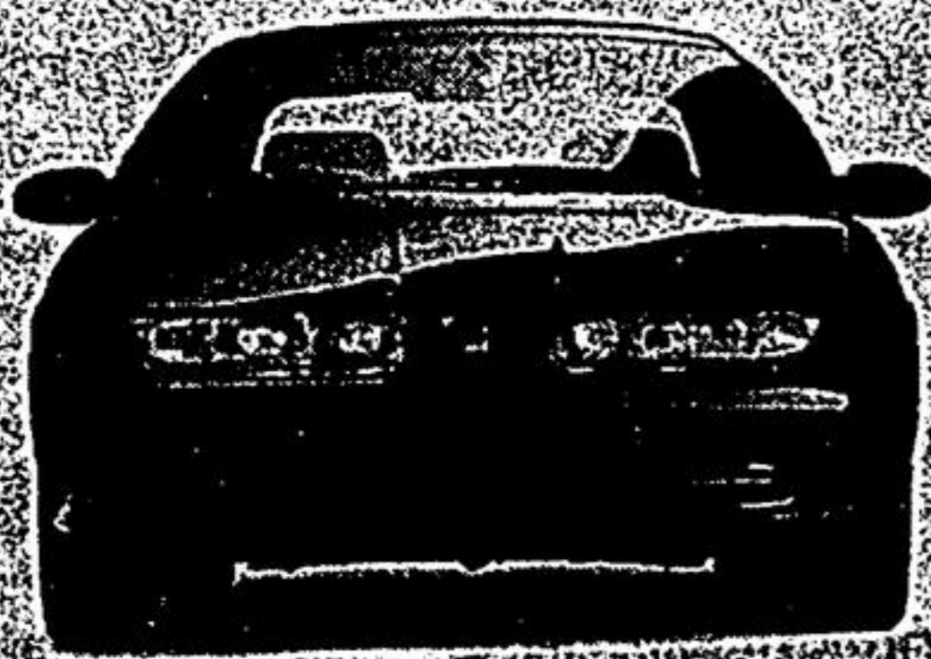
1999 Saturn SL1 4-Door Sedan

After so many collision tests, we've starting see stars. (5 of them to be exact).