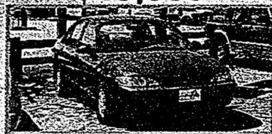
98 Escort LX Sedan Automatic, air conditioning $13,995 ***