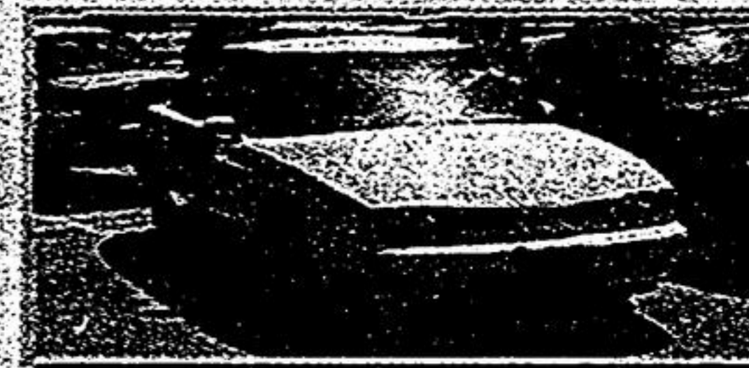
97 Oldsmobile Delta 88 Aluminum wheels, power seats. $19,995 ***