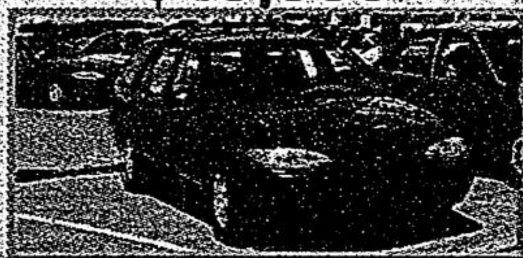
97 Escort LX Low kms, automatic. $12,795 ***