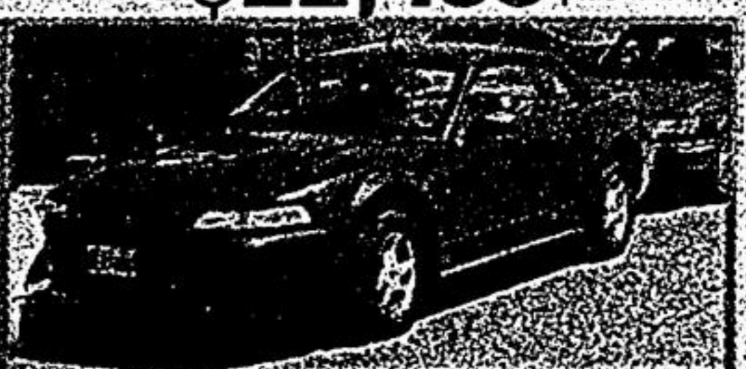
99 Mustang • 2 Door Coupe 3.8 EFI engine, air, p/windows, p/locks, rear spoiler. Stk#5746 $21,995 plus tax.