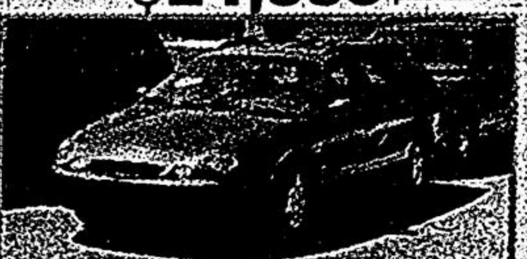
99 Taurus SE • Station Wagon Auto, antilock brakes, 6 way power seat. Stk#57186 Lease for $274 96 plus tax. 36 mths