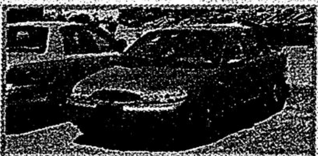
99 Contour V6 SE sport, leather, roof, traction control. Stk#57056 $22,495 plus tax.