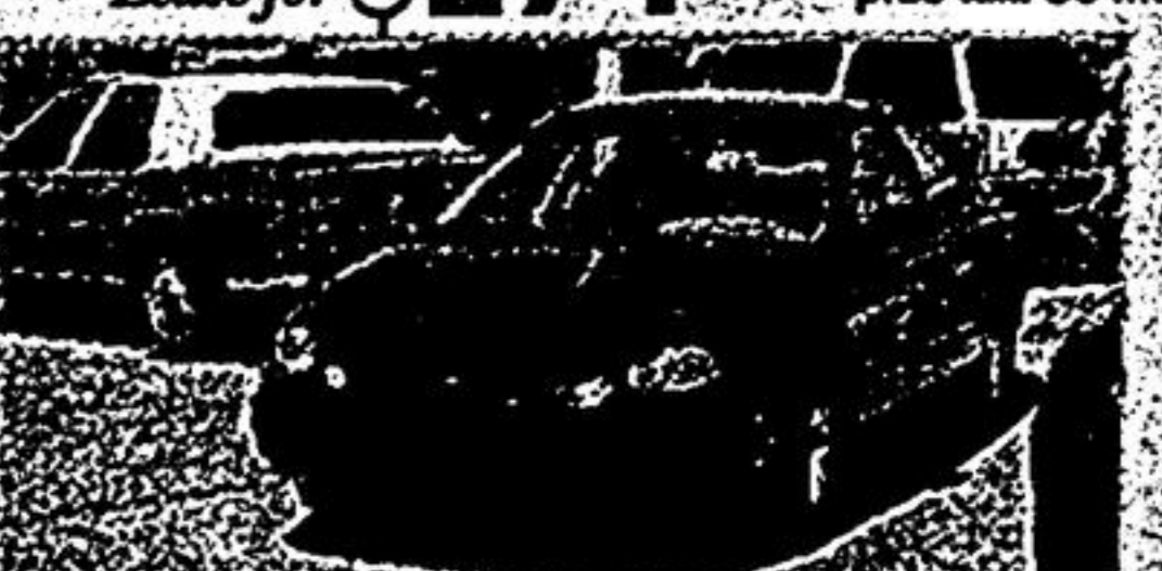
98 Taurus SE 4 dr sedan, keyless entry, rear spoiler, CD changer. Stk#56278 $22,995 plus tax.