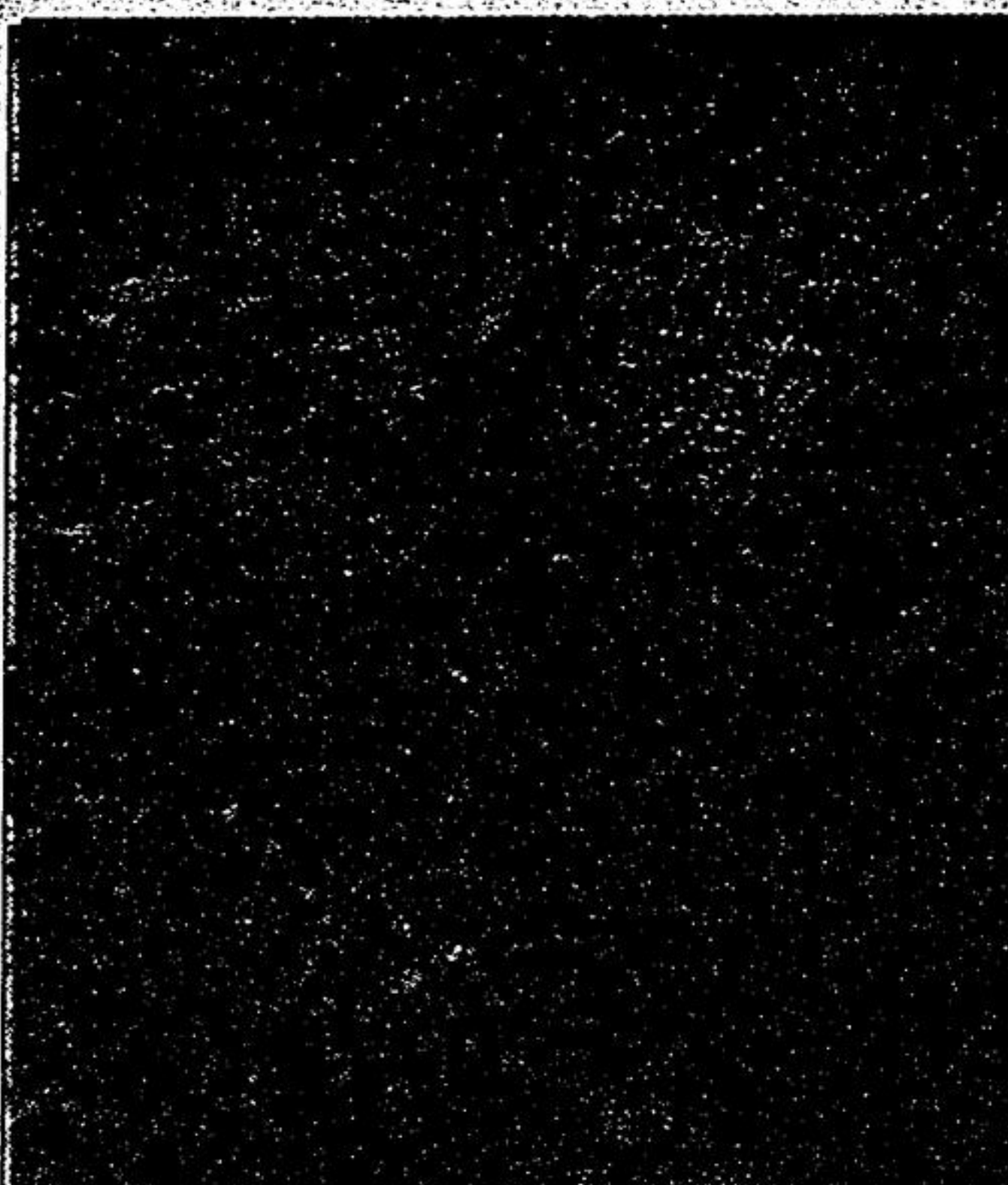
Water gardens are a great source of relaxation.

"Whether you live in a condo or own 30 acres of land, you can build a water garden to