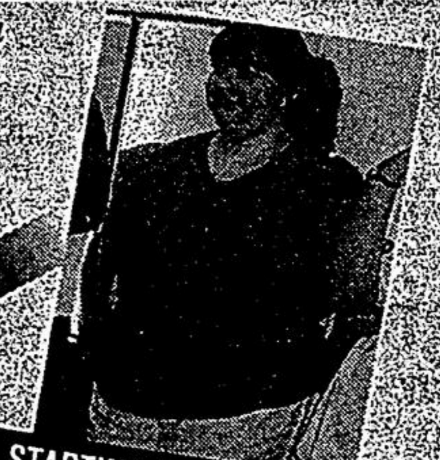
STARTING WEIGHT 216 lbs