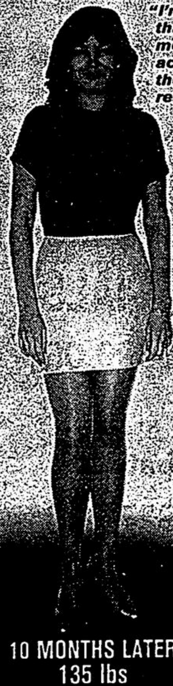
10 MONTHS LATER 135 lbs

"I'm proof that members achieve their results!"