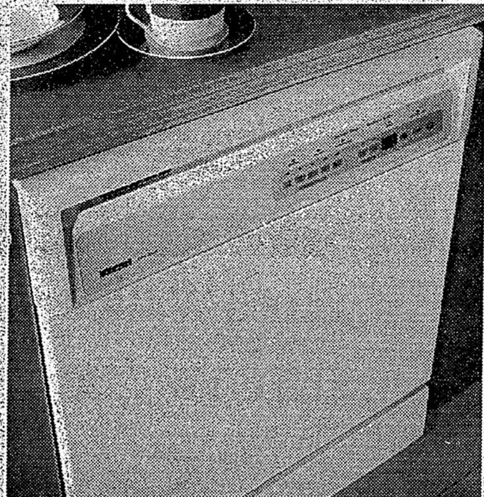
NOW $578 KENMORE™ ULTRA WASH DISHWASHER. 6 WASH CYCLES. ELECTRONIC CONTROL PANE. #15601. SEARS REG. 719.99. BLACK ALSO AVAILABLE.

All major appliances are on sale. Beat the GST* on all furniture and sleep sets or use your Sears Card and don't pay until the year 2000** plus get Double Sears Club Points†† on all furniture, sleep sets and major appliances.