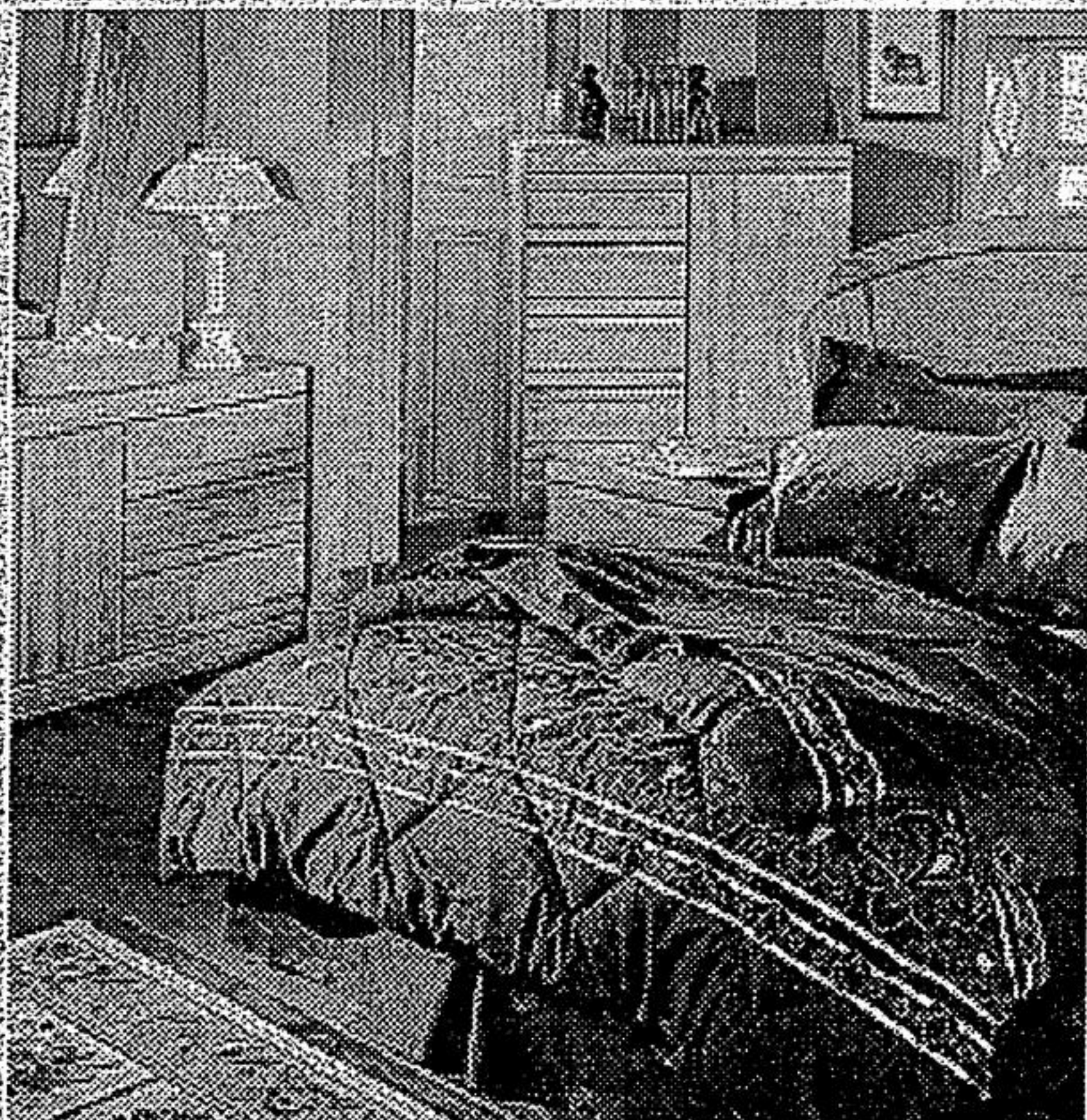
SAVE $400 1199.96. RHODE ISLAND 4-PC SUITE OAK OR OPAL FINISH. SEARS REG. 1599.96. CONSISTS OF HEADBOARD, DRESSER, MIRROR & NIGHT STAND. PLUS RECEIVE BONUS NIGHT STAND* (SEARS REG. 249.99) WITH PURCHASE.