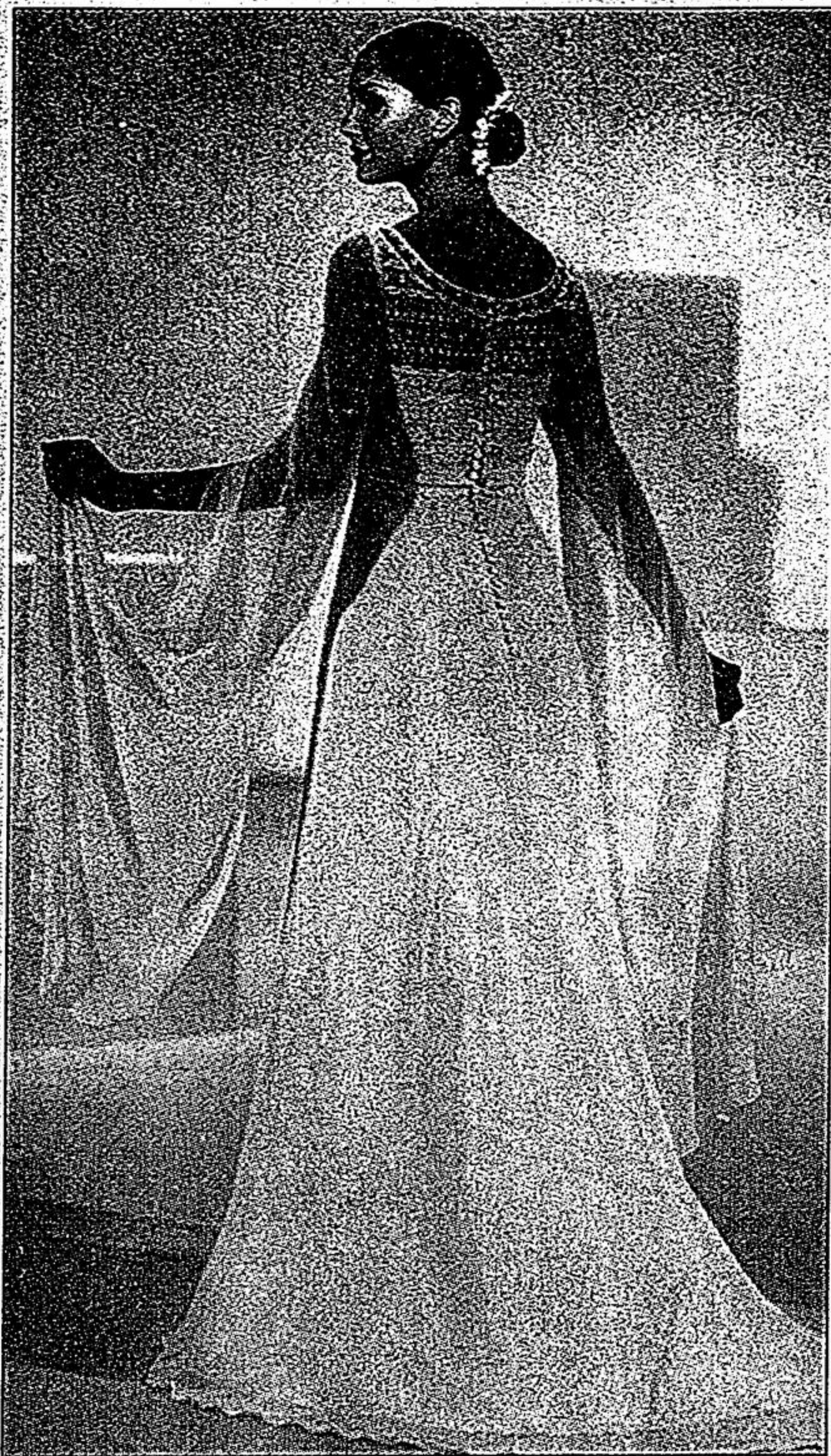
This year, the Renaissance look is popular.

People will find gorgeous Renaissance-inspired gowns in ivory and candle lite