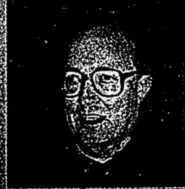
Ed Williamson Equipment

Email: waxers@toramp.net Website: www.toramp.net/waxers