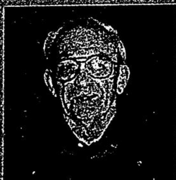
Bob Wilson Equipment

SEASON'S GREETINGS to all our FANS and SPONSORS Newmarket Classic Tournament - Christmas Break Call our Hotline for details 905-294-2699