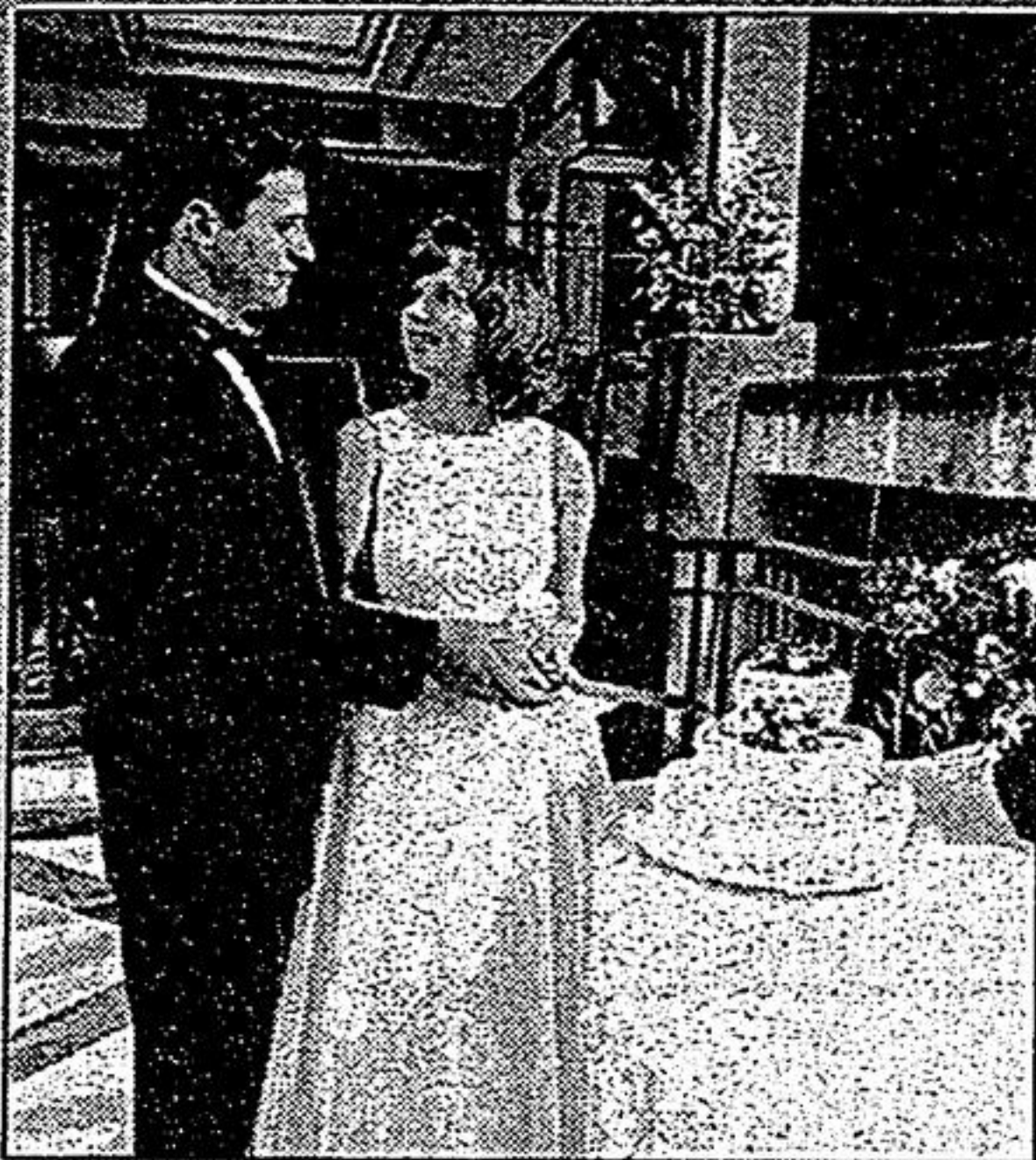
Sheraton Parkway Toronto North Hotel wants to make your wedding a memorable experience.

Sheraton Parkway offers an extensive package that includes an air-conditioned banquet hall, (serving 50 to 1,000 people), champagne and fruit punch on arrival, an assortment of hot hors d'oeuvres, a four-course meal and four hours of open bar, candleabra on the head table, candles and flowers on the guest tables, two litres of house wine per table of 10, special bedroom rates for guests, a suite with chilled champagne and breakfast the next morning for the couple and more.