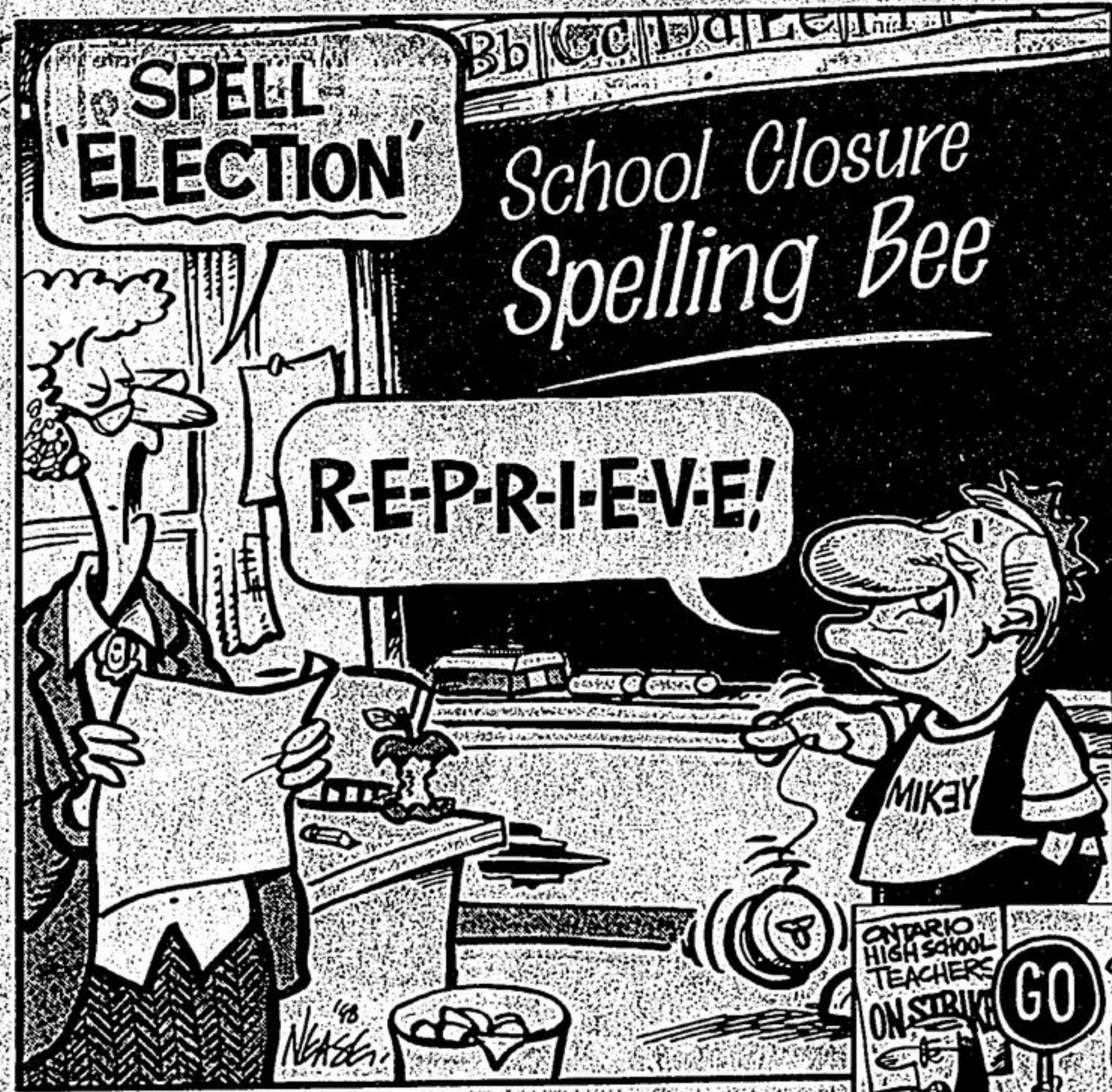
Was it a spelling mistake or a political mistake?