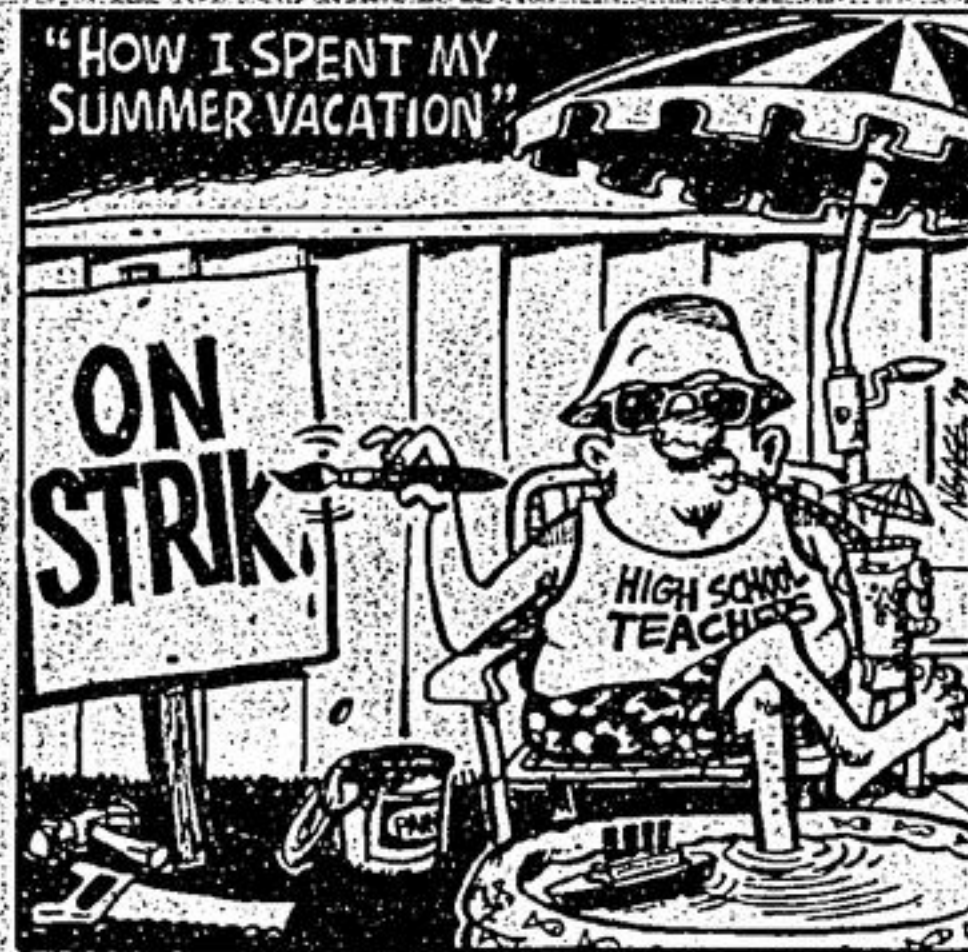
(Left) A summertime strike for secondary school teachers didn't escape Nease's pen.