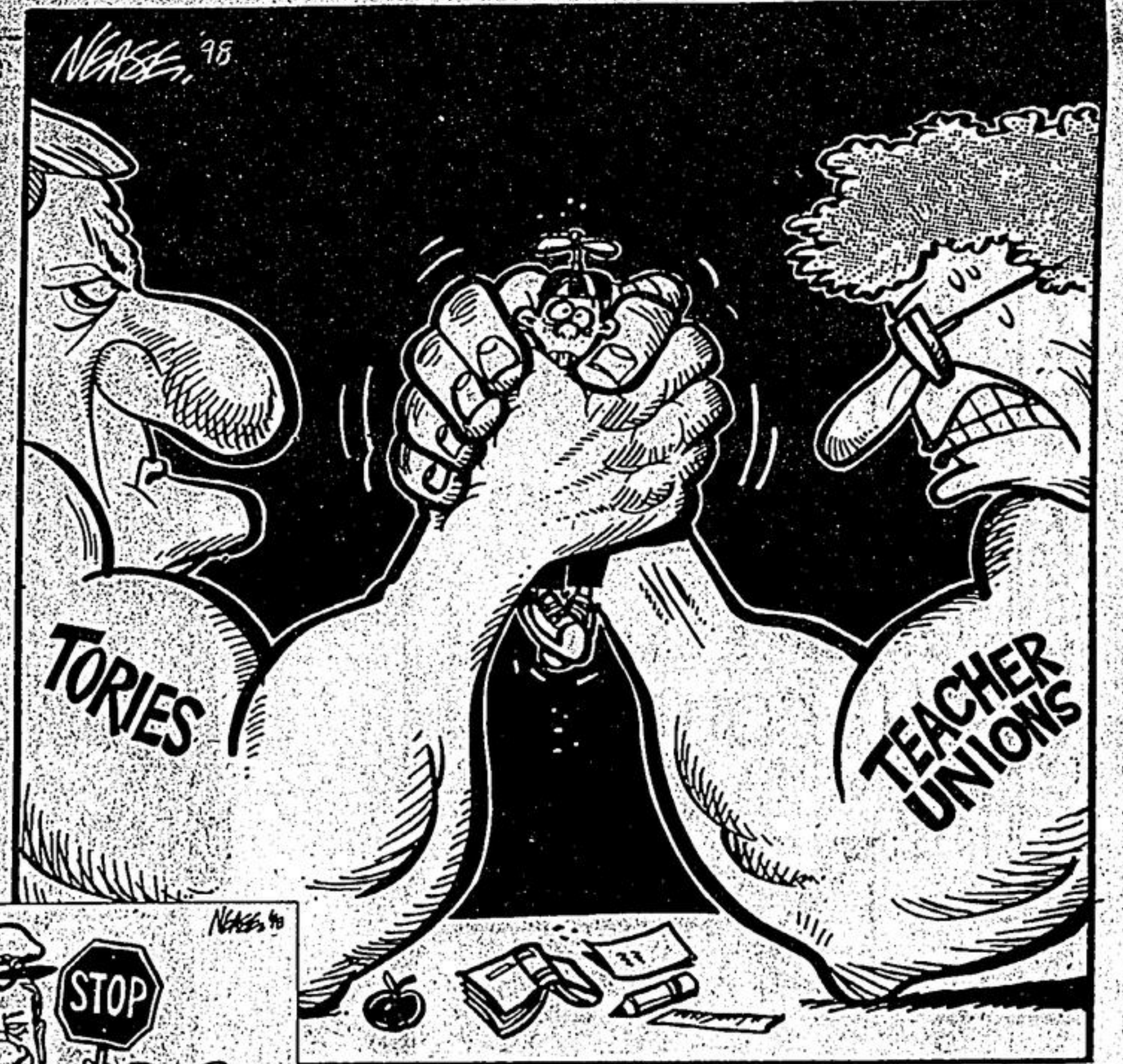
Arm wrestling over education