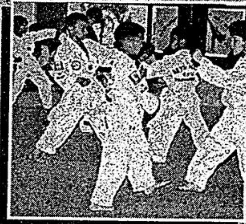
Classes for Men, Women & Children as young as 4 yrs. old