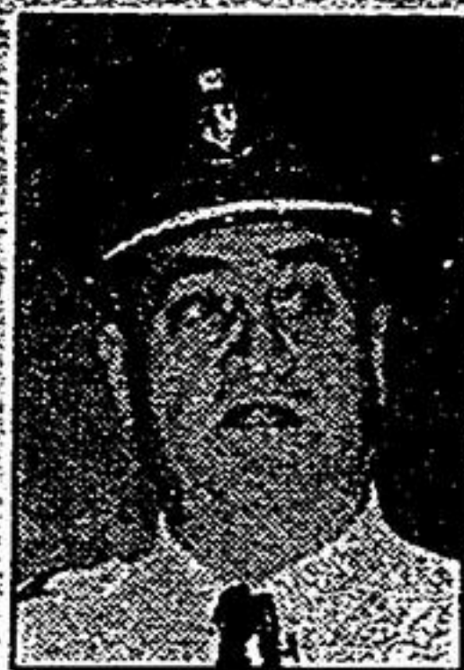
JULIAN FANTINO Focus is on education and enforcement

"We have to develop priorities to spend the taxpayer's dollars wisely," Fantino said. "The question is not can we afford it, the question is can we afford not to?"