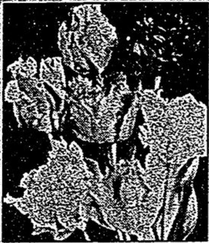
The Parrot tulip.

When the bulbs are dry, they are peeled and graded. Bulb by bulb, each is picked and stripped of its smaller bulblets and old outer scales. Every one of the tens of millions of bulbs will be given this treatment. After that, the whole lot goes to the packing department where they are counted and packaged in the sacks and boxes that will find their way to points of sale world wide. When confronted with the sight of all those packages, you can't help but imagine the promise of colourful blossoms held within these somewhat unsightly onion-like objects. However,