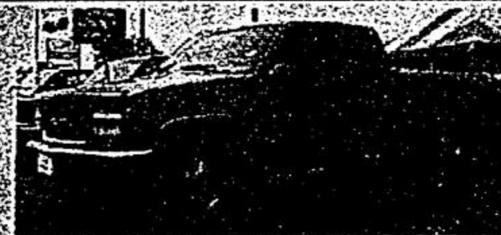
1995 G.M.C. Z71 4X4

Fully loaded inc. leather interior: ONLY 90,667 km's: Certified. $25,950