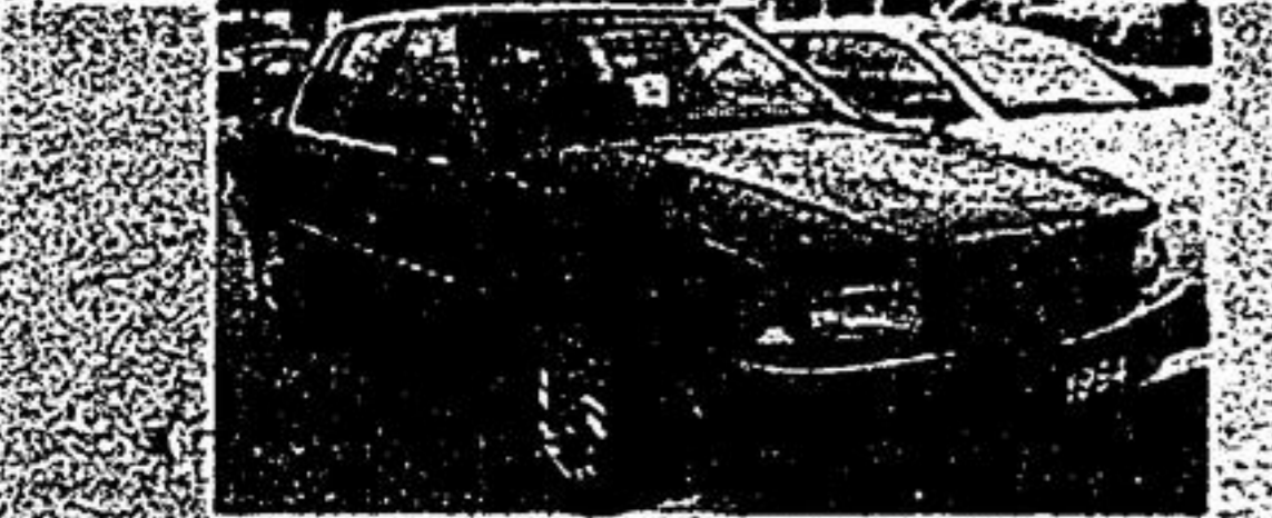
1994 DODGE SPIRIT

Affordable & economical: 81,916 km's with air cond.: Certified $9,900