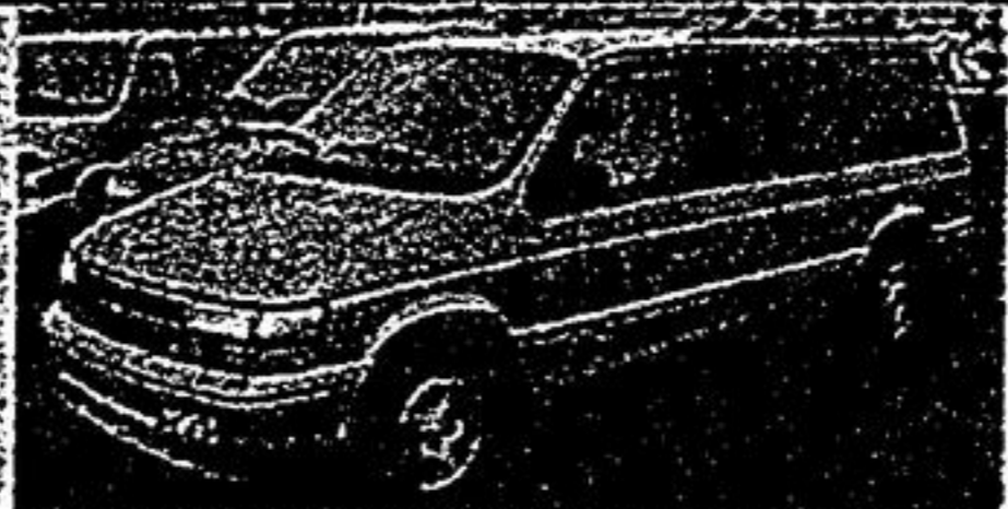
1995 GRAND CARAVAN LE

Air conditioning, p.w., p.l., cruise, tilt, alum: 40,000 km's $17,350