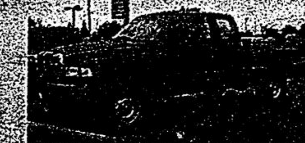
1996 RAM 1500 4X4

Air conditioning, auto cruise, tilt, cassette. $21,500