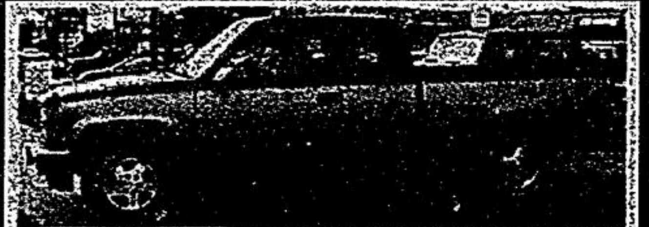
1995 G.M.C. Z71 4X4

Fully loaded with ONLY 63,123 km's: Certified. $26,500