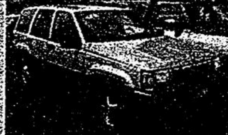
1995 GRAND CHEROKEE LAREDO

Fully loaded inc. air cond., p.w. & locks and much more: ONLY 58,800 km's: Certified. $25,900