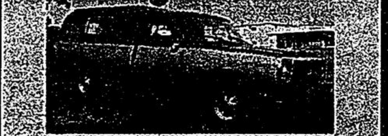
1992 DODGE RAM 150 LE

Air cond., p.w., p.l. ONLY 109,000 km's: Certified. $10,900