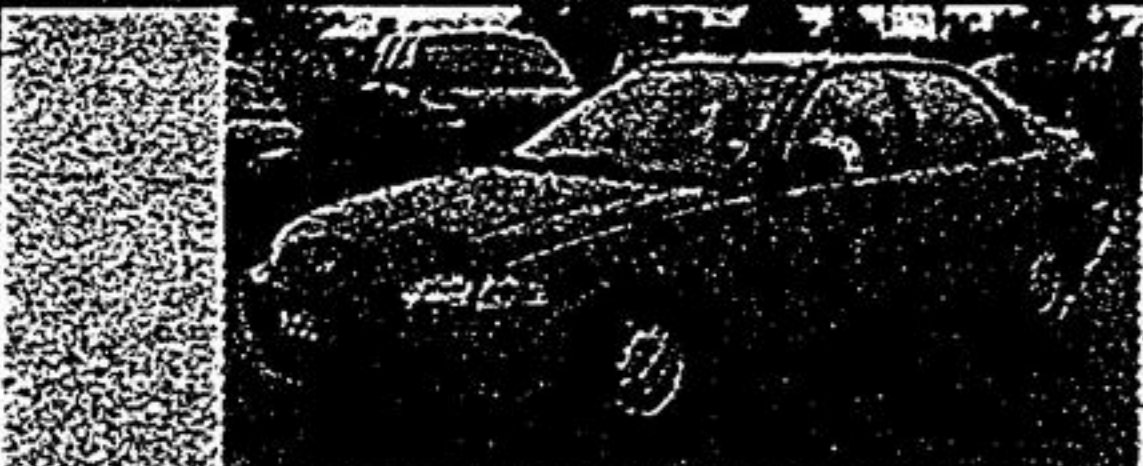
1995 HONDA CIVIC

5 speed, air conditioning, cassette $14,495