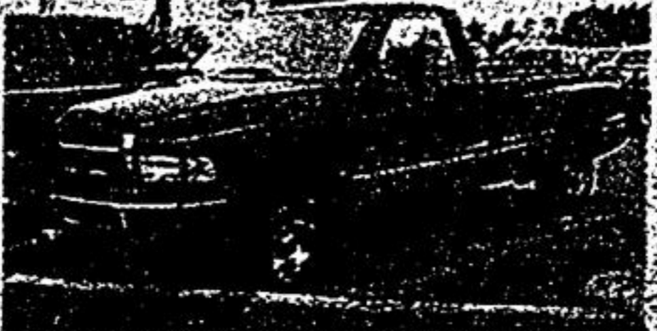
1997 RAM 1500

V8, air, auto. Great work truck. $18,450