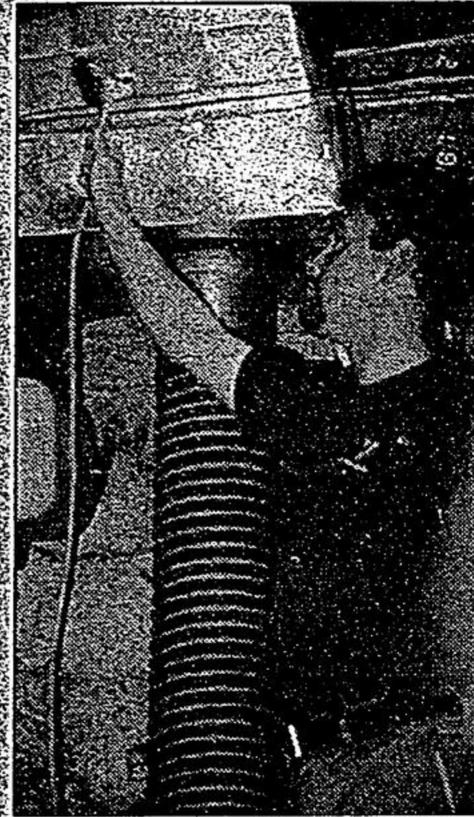
People should clean their ducts every three to five years.

For details contact V Care at 416-321-1974 or visit their website at www.vcare.com .