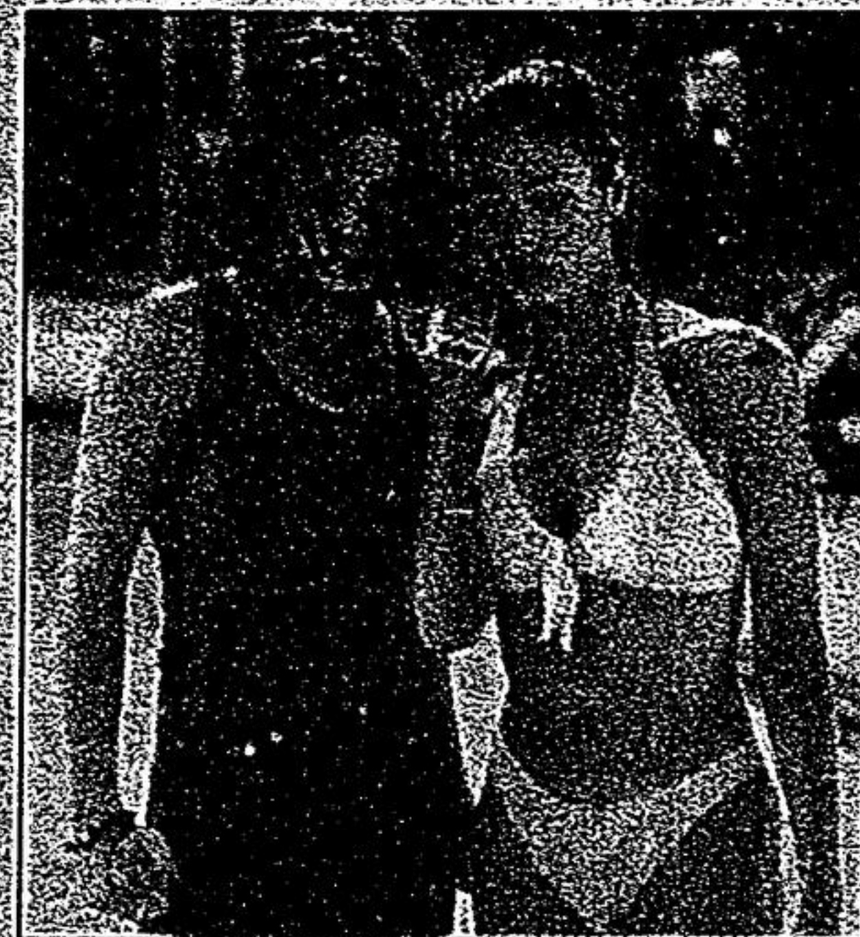
Neve Campbell and Denise Richards are Wild Things

ON VIDEO: In praise of experience and intelligence