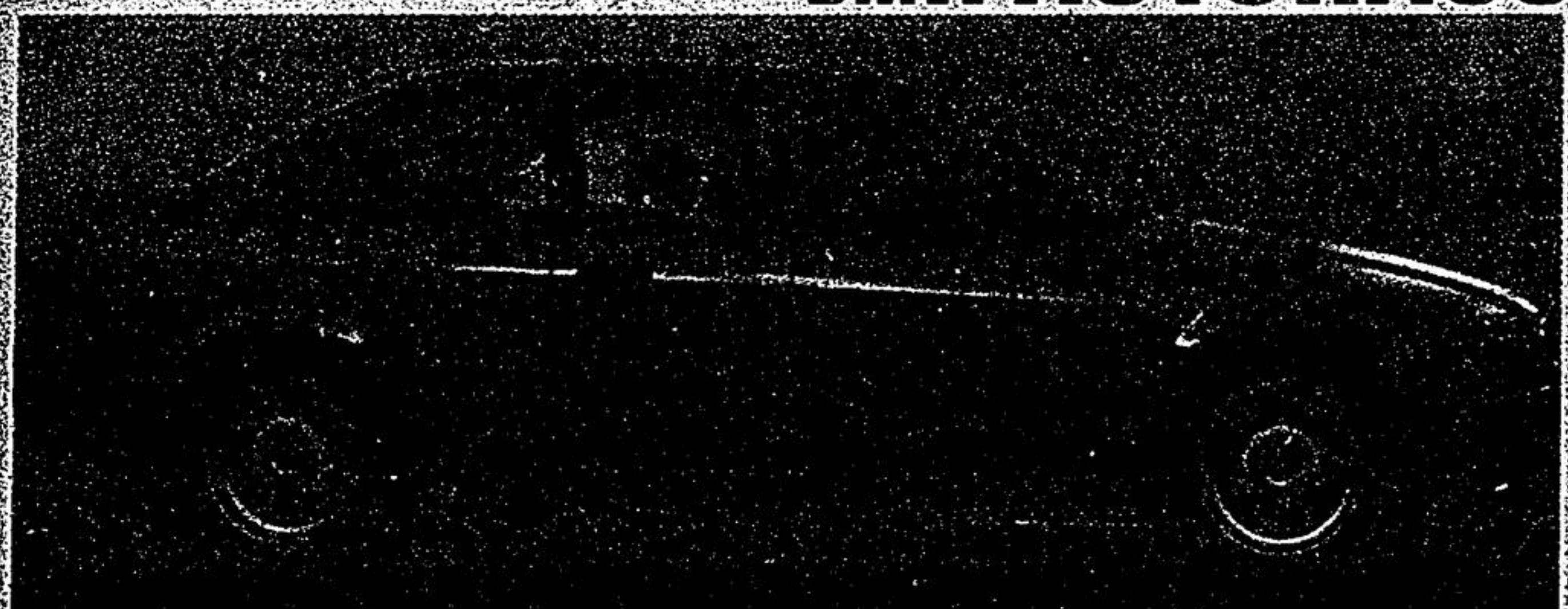
NORTH MARKHAM HONDA