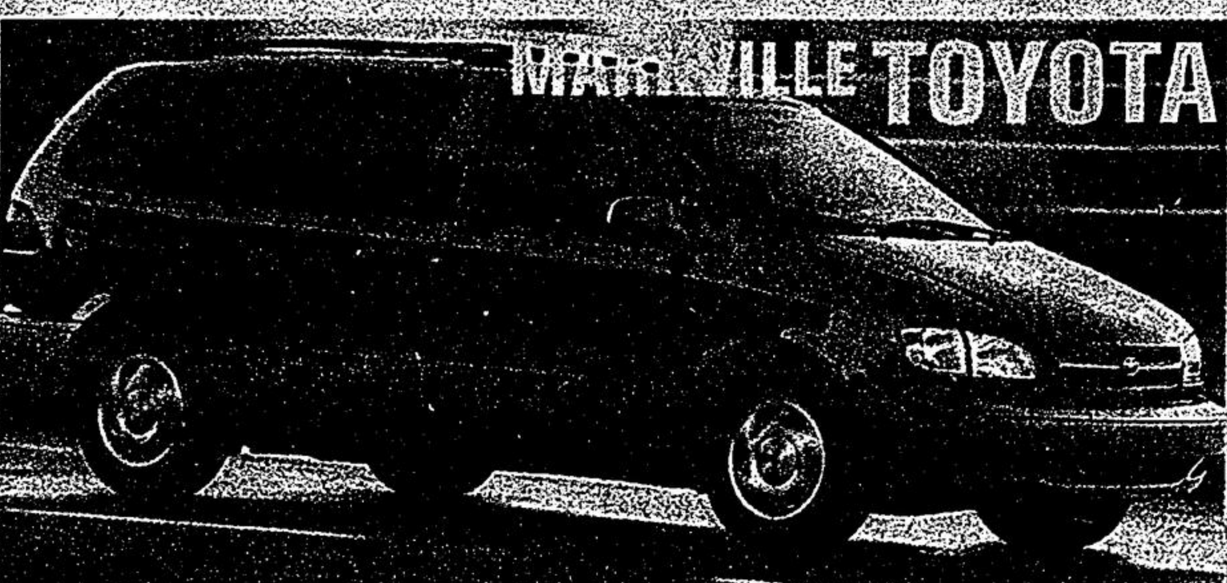
MARKHAM VILLE TOYOTA