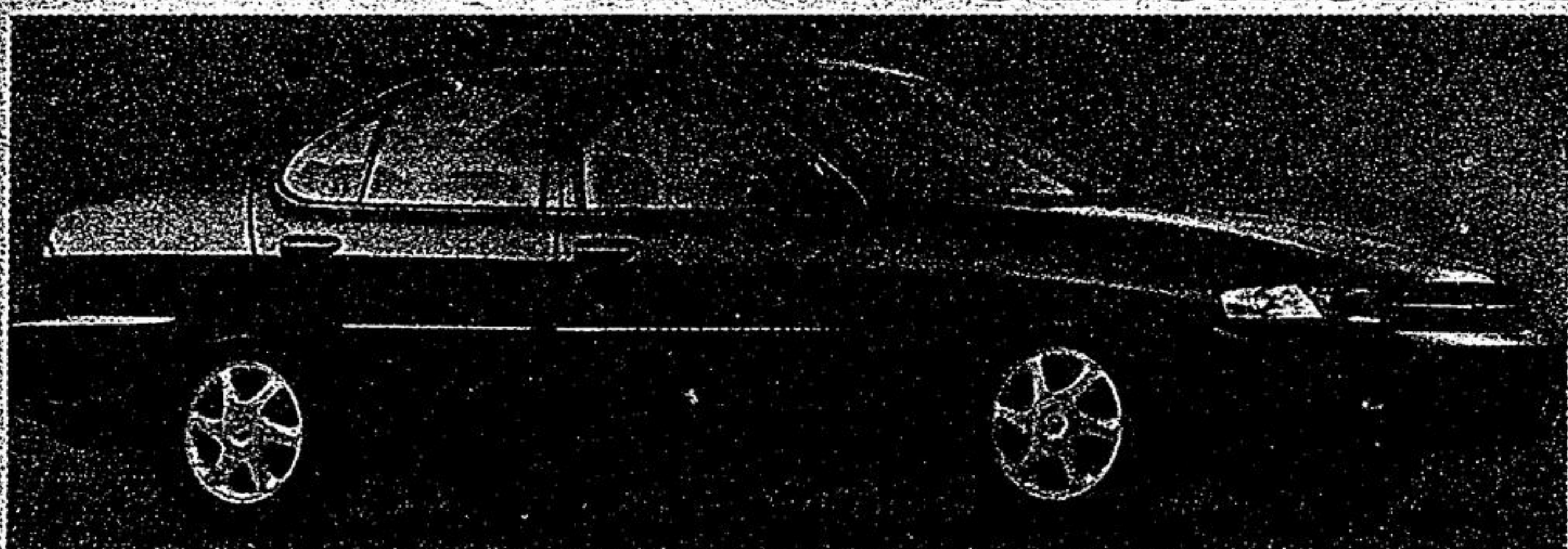
VILLAGE NISSAN BMW AUTOHAUS