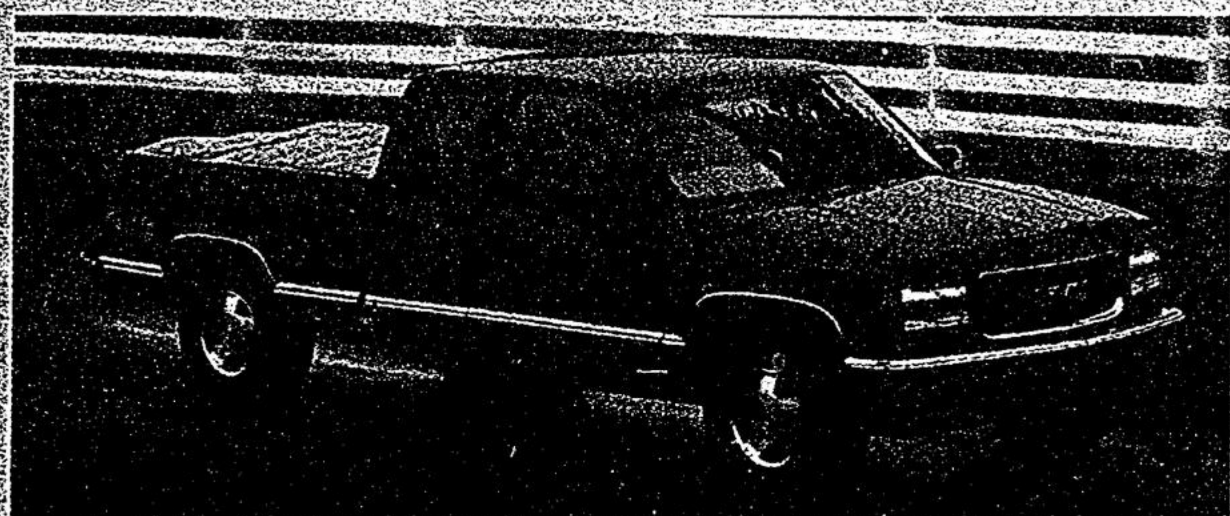
UNIONVILLE MOTORS PONTIAC • BUICK • GMC