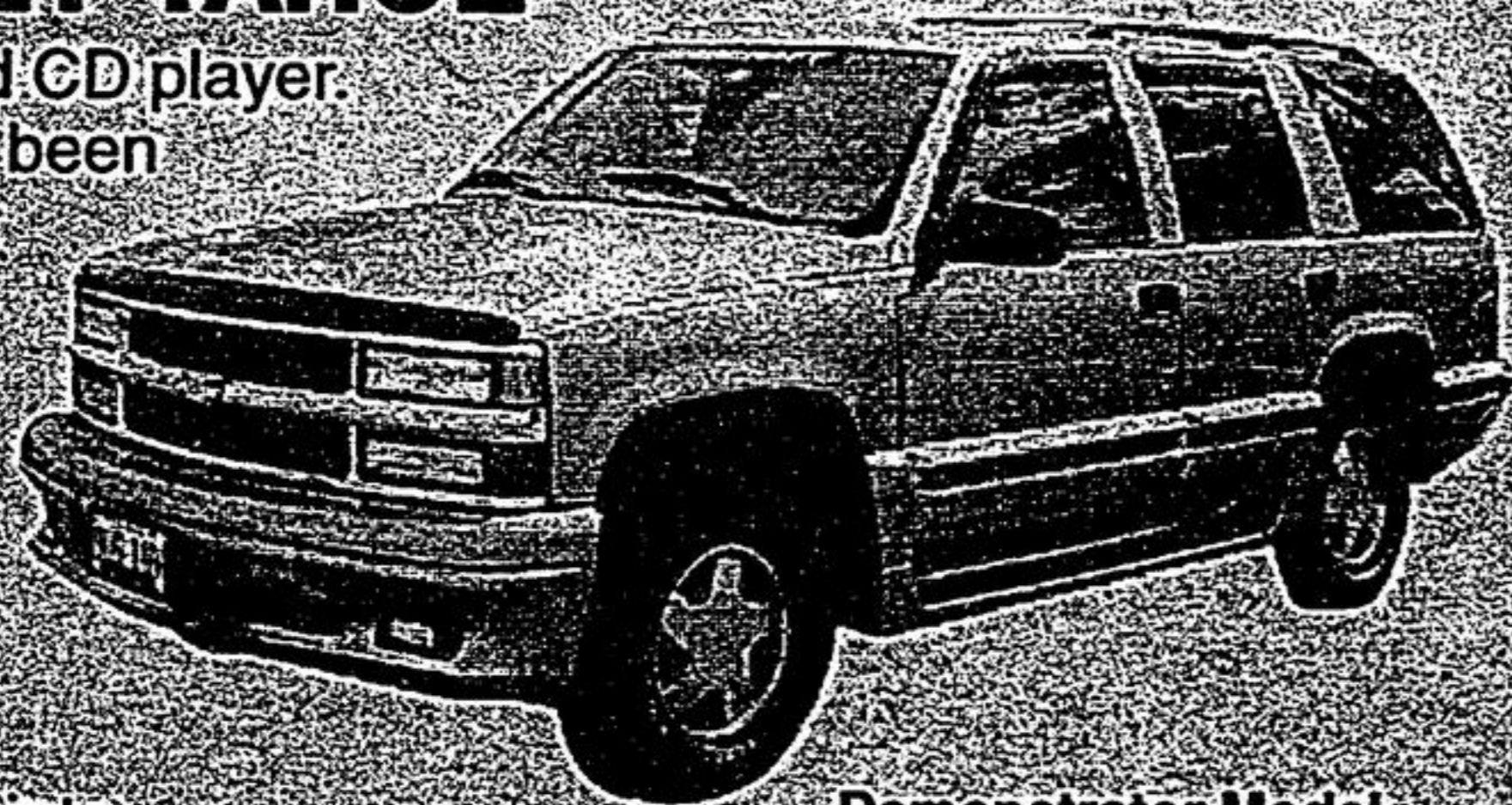
Demonstrator Model Stk. #90046

Come in and see why North Pointe Chevrolet Oldsmobile and Starcraft Automotive are your #1 choice in high quality conversion vans or trucks.