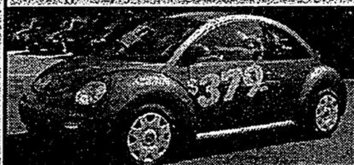
1998 VW Beetle