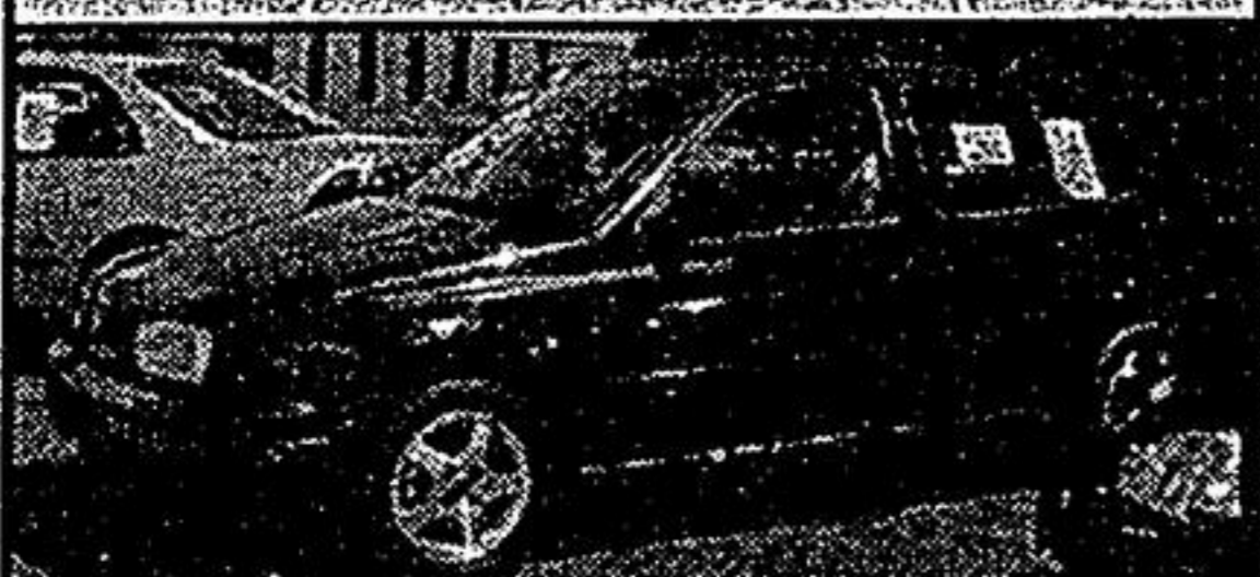
1998 VW Golf