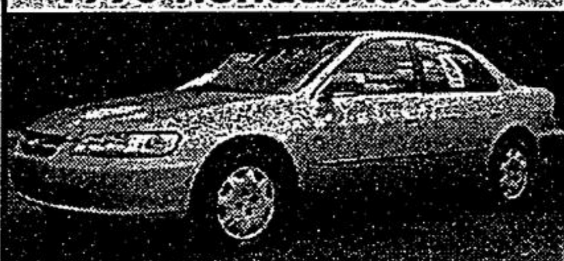
1998 Honda Accord