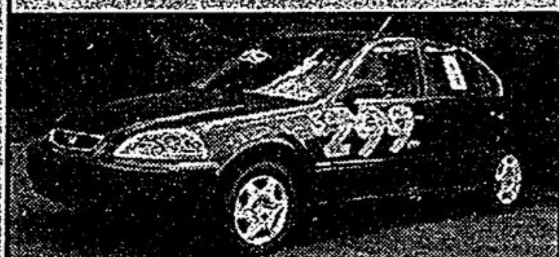
1998 Honda Civic