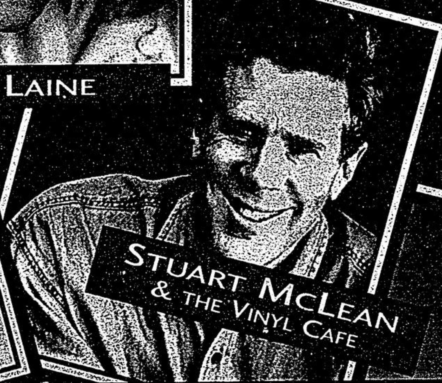
STUART MCLEAN & THE VINYL CAFE