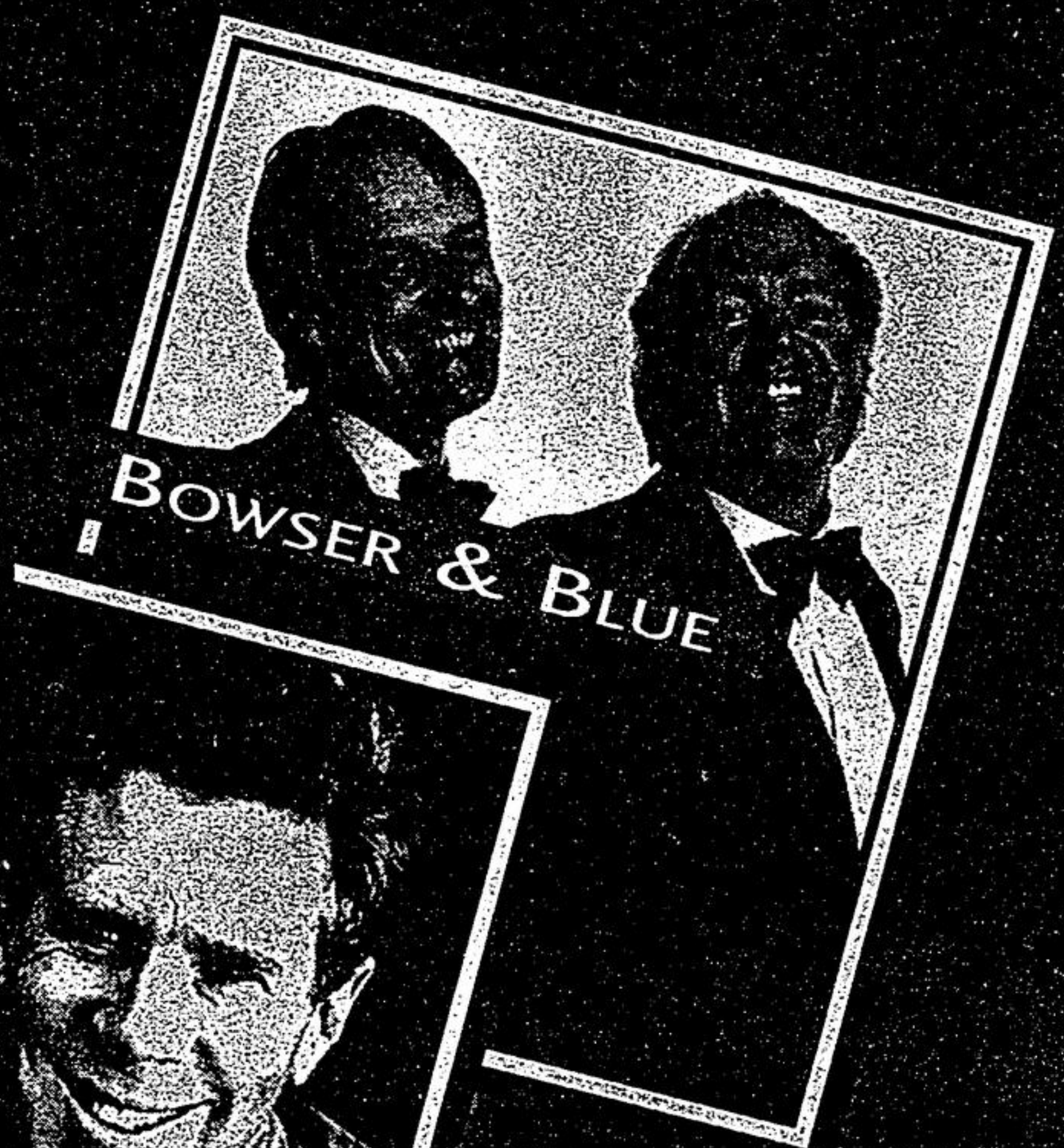
BOWSER & BLUE