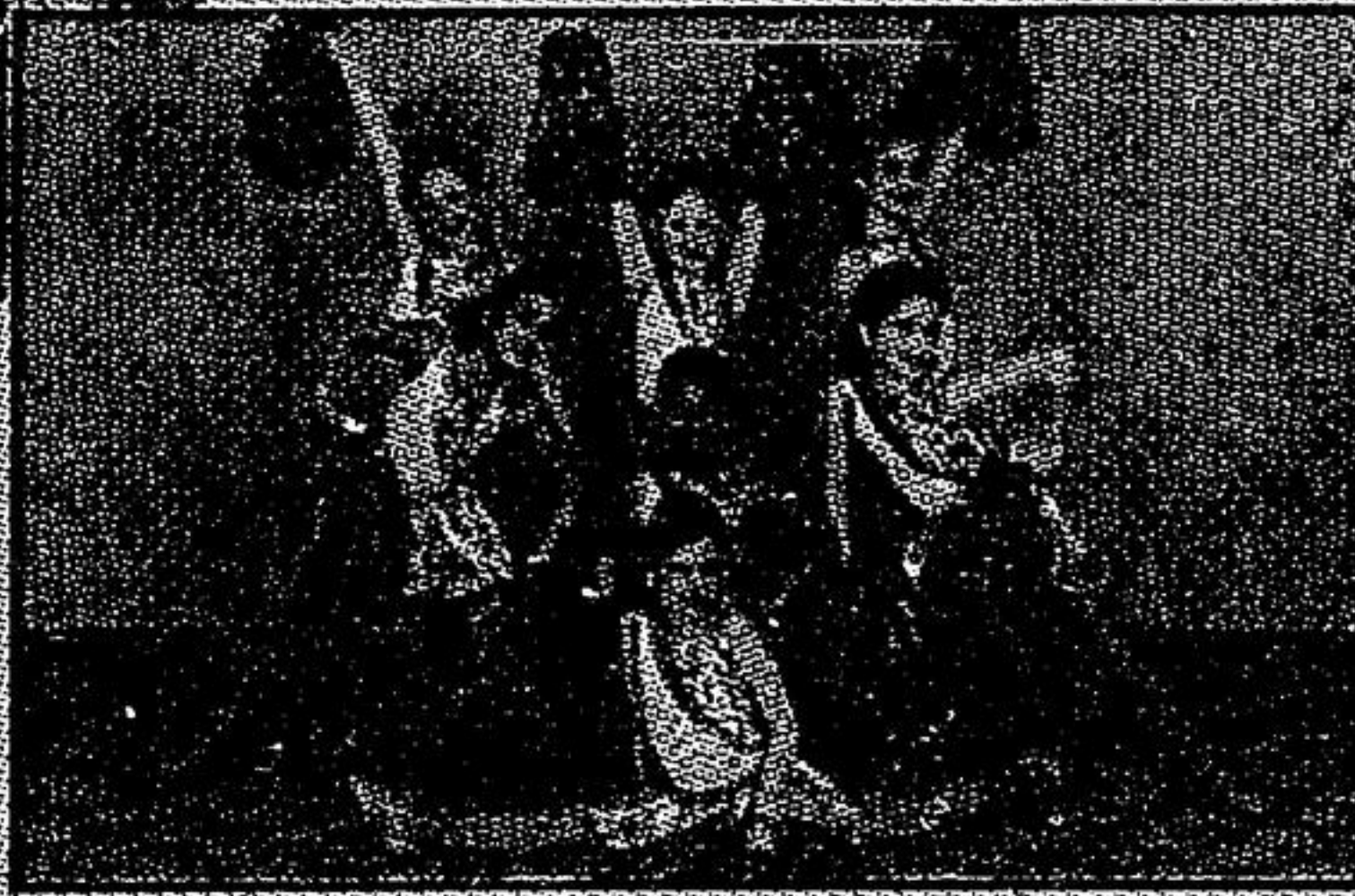
Won 6 First Place awards in Jazz & Tap during their 1st year of competition.