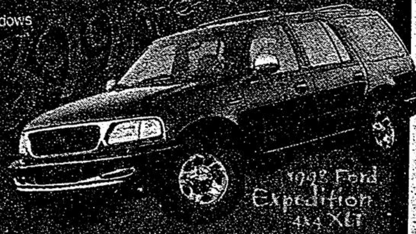
1998 Ford Expedition 4x4 XLT