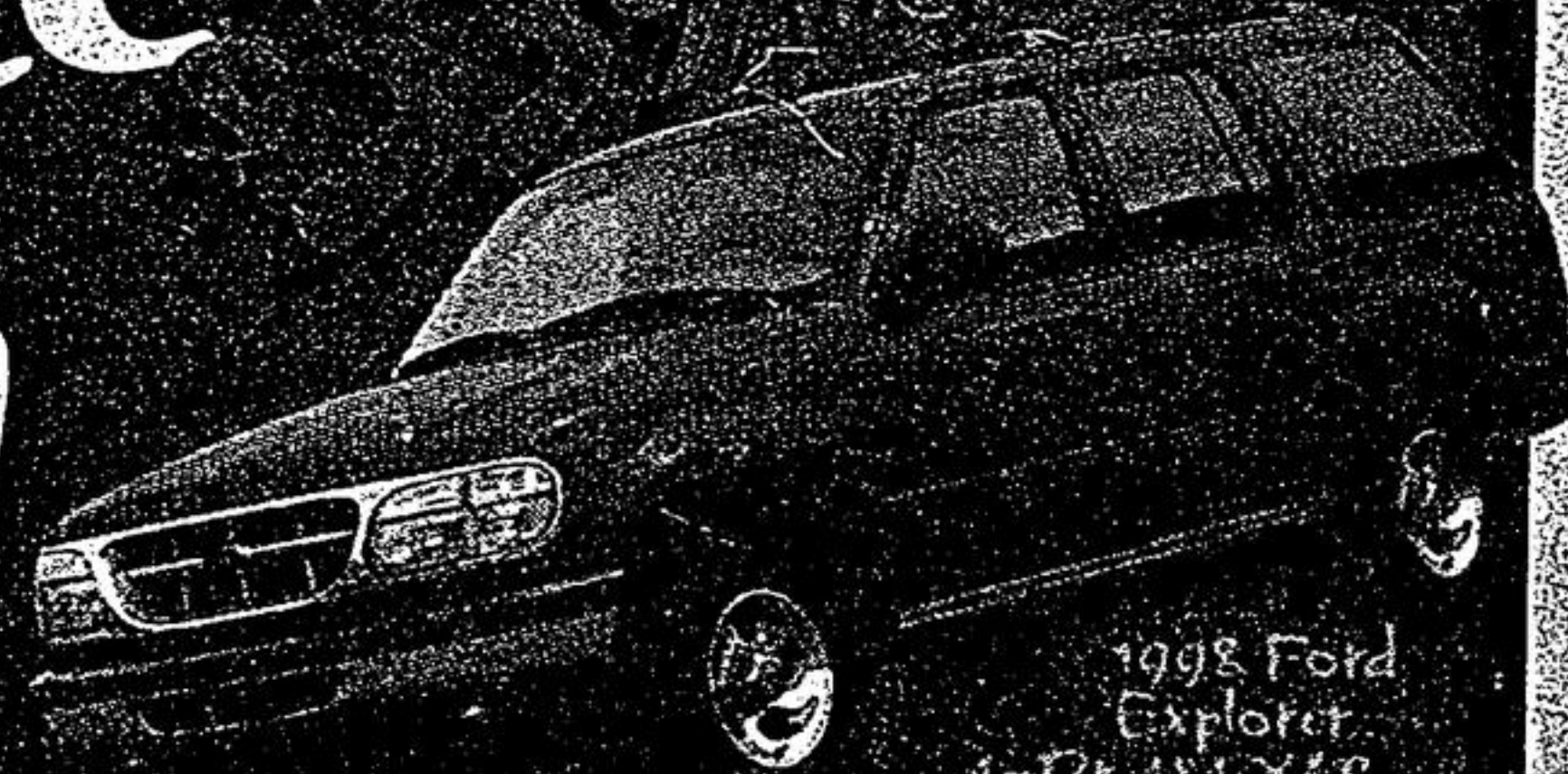
1998 Ford Explorer 4-Dr. 4x4 XLS