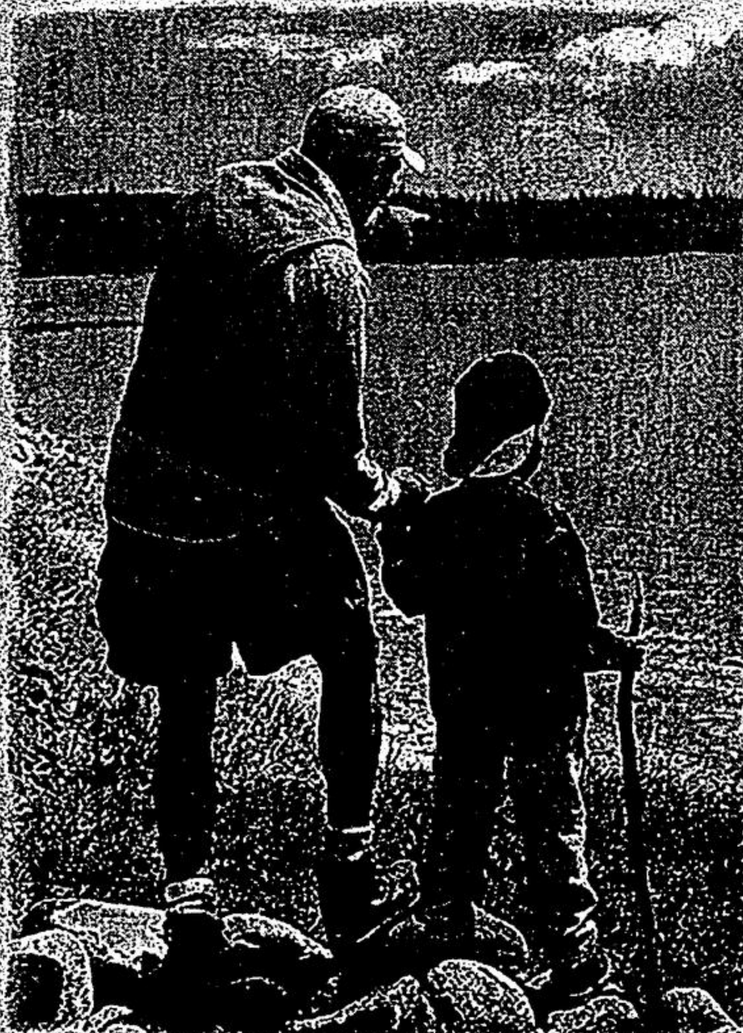
RIDING MOUNTAIN NATIONAL PARK, MANITOBA