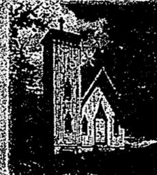
GROSSE ILE AND THE IRISH MEMORIAL NATIONAL HISTORIC SITE, QUEBEC