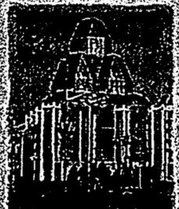
NATIONAL GALLERY OF CANADA, OTTAWA

Landscapes of spectacular beauty. Places where people have made history. Treasures of the past that tell us stories of the extraordinary and the everyday. These things are for all of us - to enjoy, to share and to cherish. They are our heritage and our legacy, our spirit and our strength. They are Canada's National Parks, National Historic Sites and National Museums.