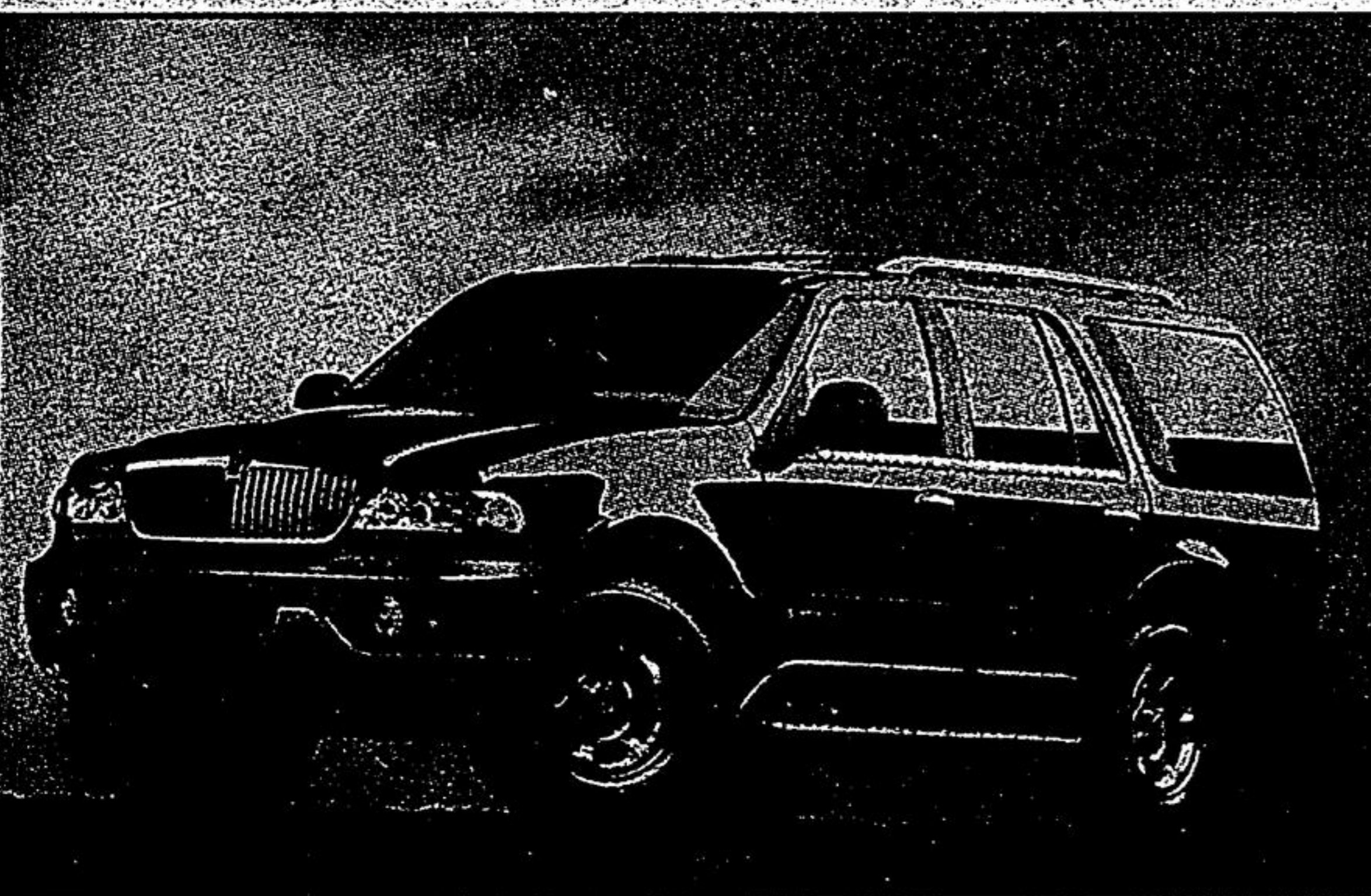
The 1998 Navigator