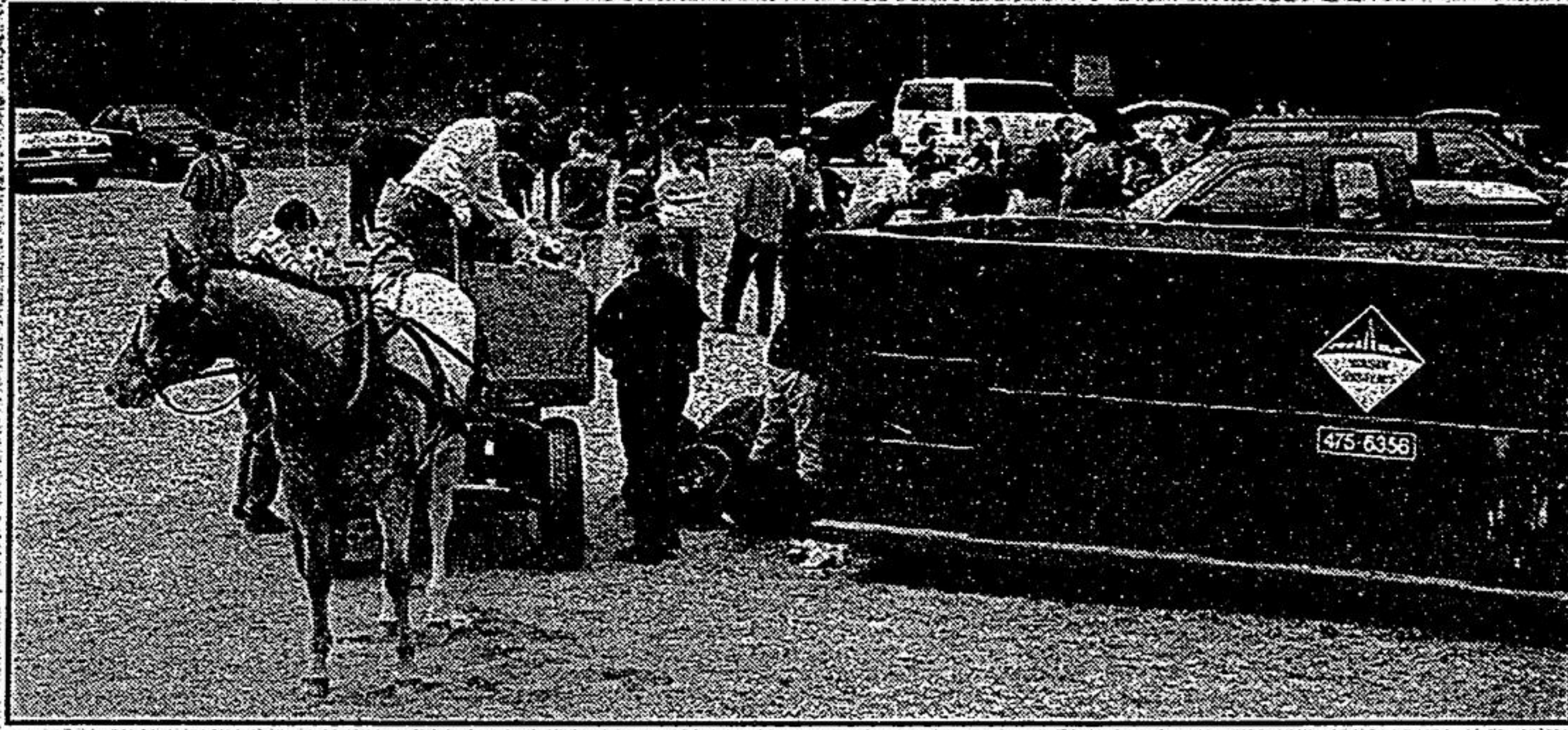
The green clean-up crew got down to work on May 2 at the annual beautification project in and around the York Regional Forest in Whitchurch-Stouffville.