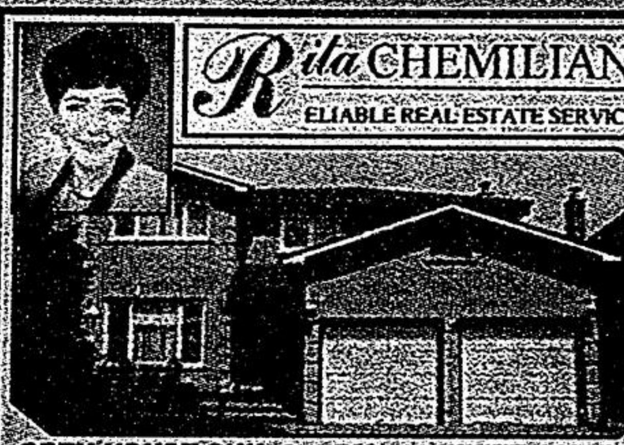
Rita CHEMILIAN ELIABLE REAL-ESTATE SERVICE

CALL RUTH KLEM TO VIEW THIS SPECIAL PROPERTY!