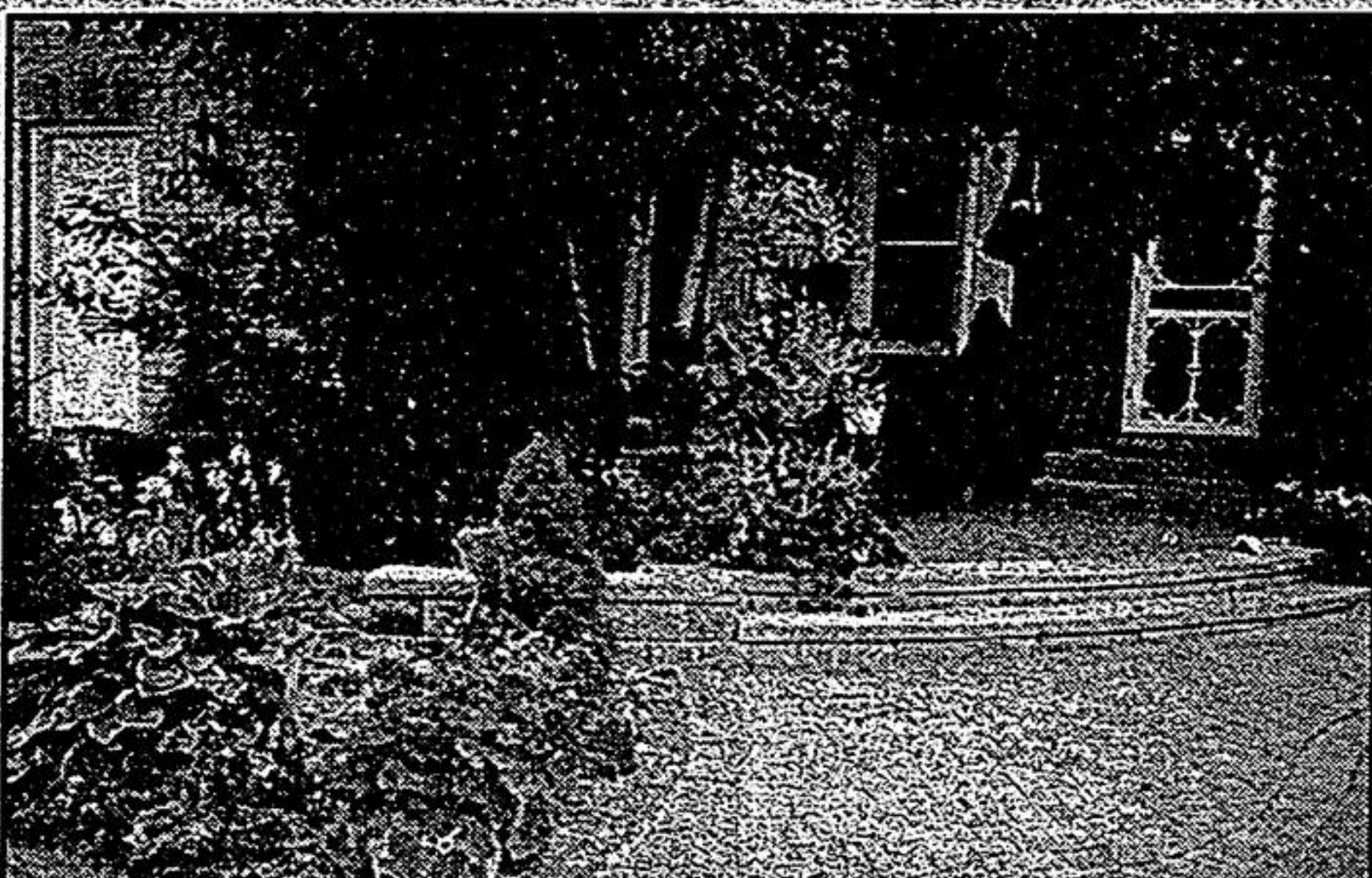
Stepping Stone Landscaping quality and service in every step