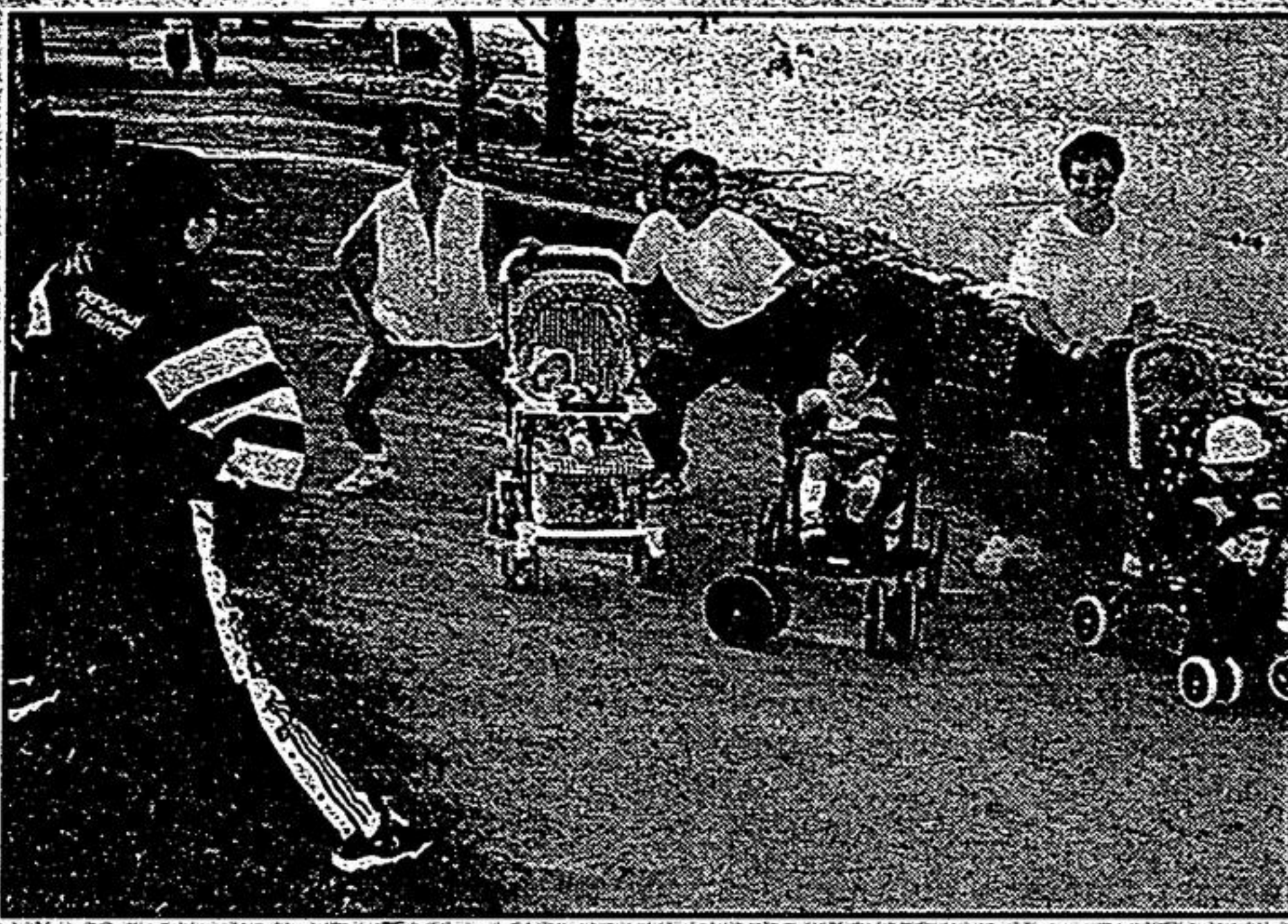
The only thing you need to participate in this class is a baby in a stroller, comfortable clothing and a good pair of shoes.

But exercising isn't the only thing participants can look forward to. StrollerFit also offers new moms an opportunity to form a