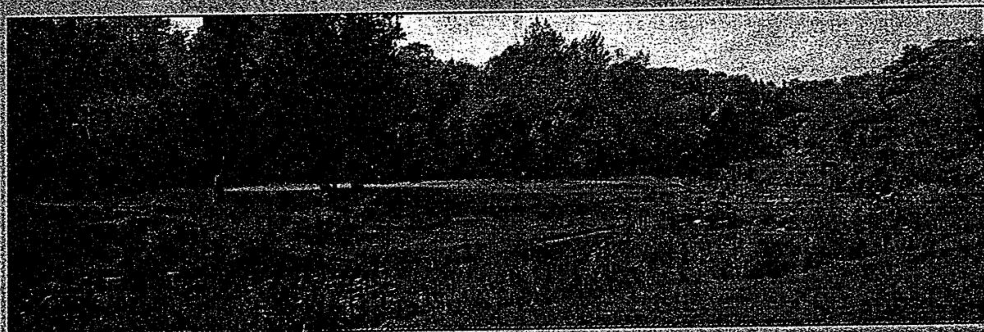
The Legacy Run takes place along the streets of Legacy, throughout the trails in the Rouge River Valley and on the nine-hole golf course.

Tie up your sneakers, grab the kids and take stroll through the Rouge River Valley