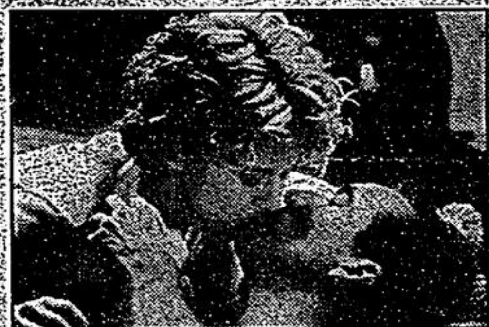
Meg Ryan and Nicolas Cage get romantic in City of Angels .

But that's a small part of an otherwise effectively paced and hugely entertaining romantic comedy.