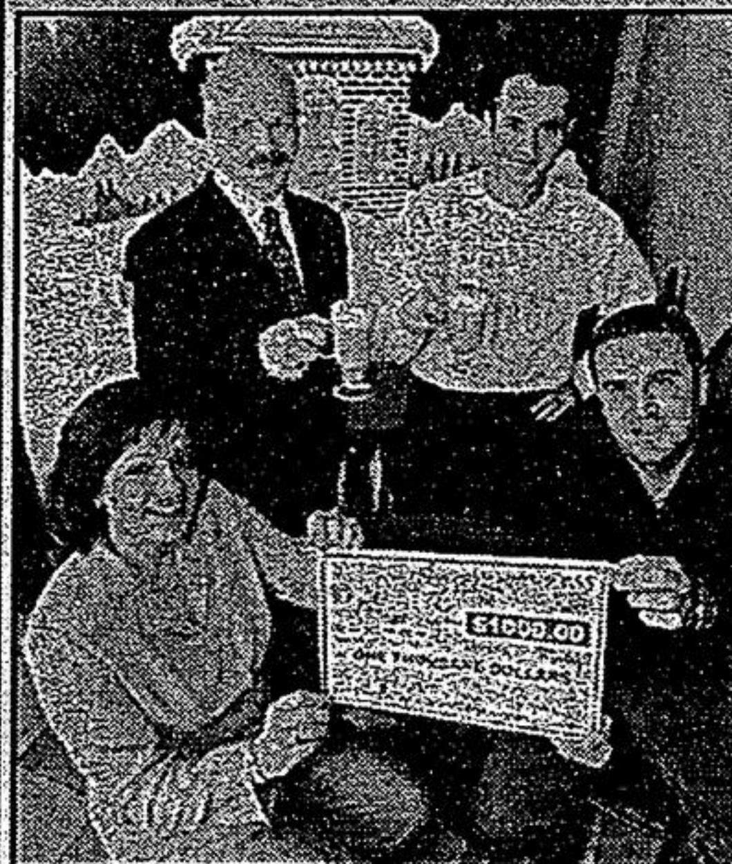
Caffé Demetre presents a cheque for $1,000.

Staff at Caffé Demetre hosted their first Fashion Show in March raising $1,000 for the York Region Heart and Stroke Foundation.