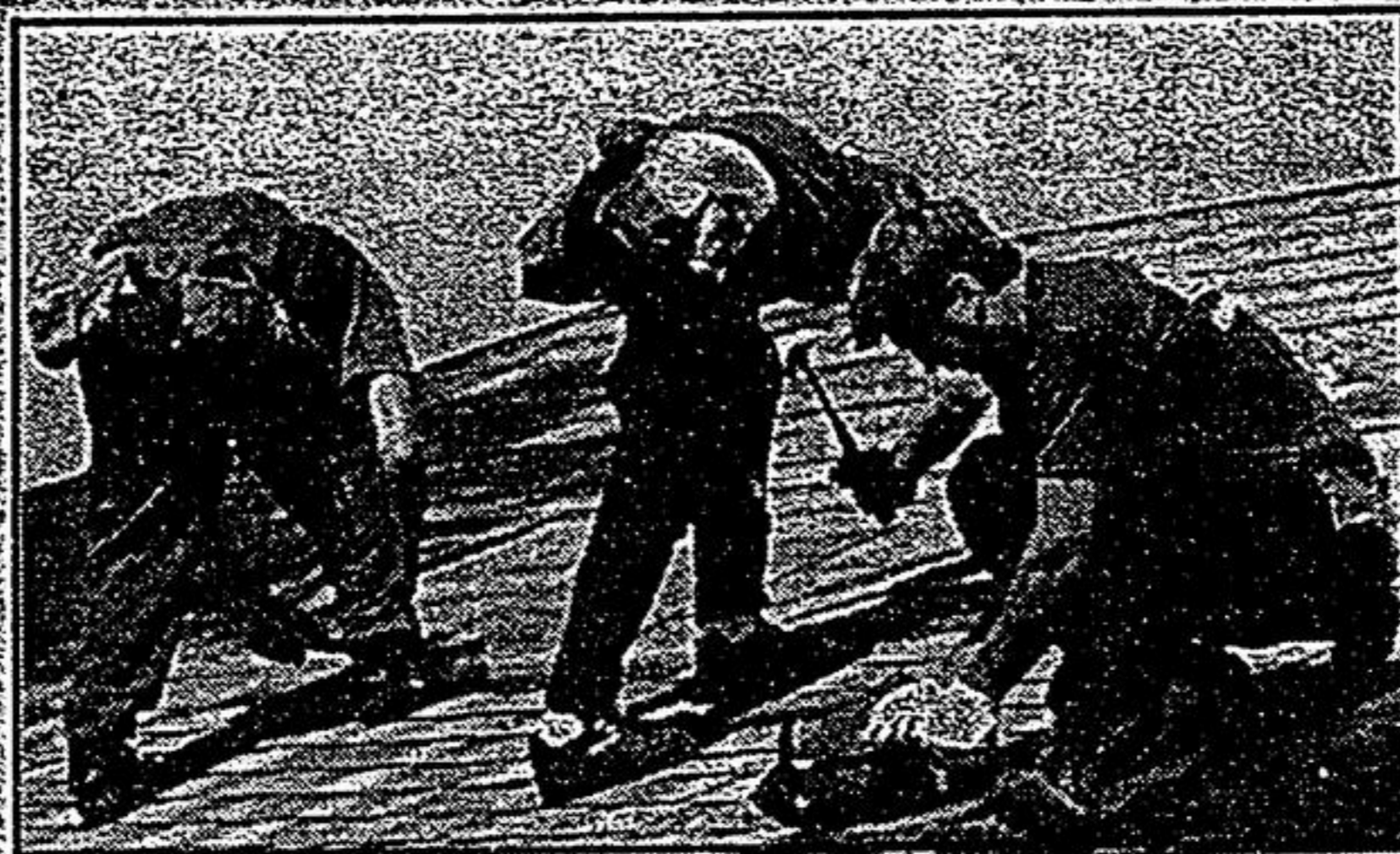
Keeping the roof of your home properly sealed, insulated and vented is key to keeping your house warm in the winter and cool in the summer.

• Buy a new fridge. In the most popular size range, today's energy-efficient refrigerators use more than one-