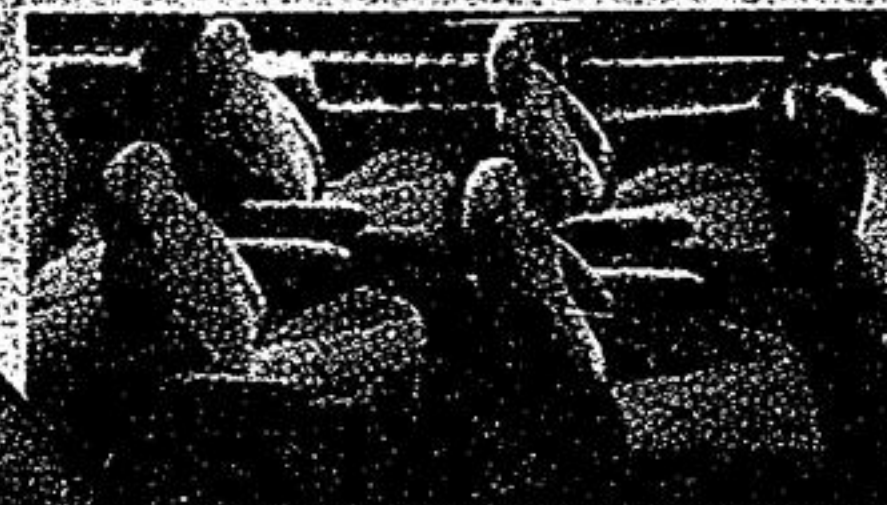
Includes the Luxury of Quad Captain's Chairs