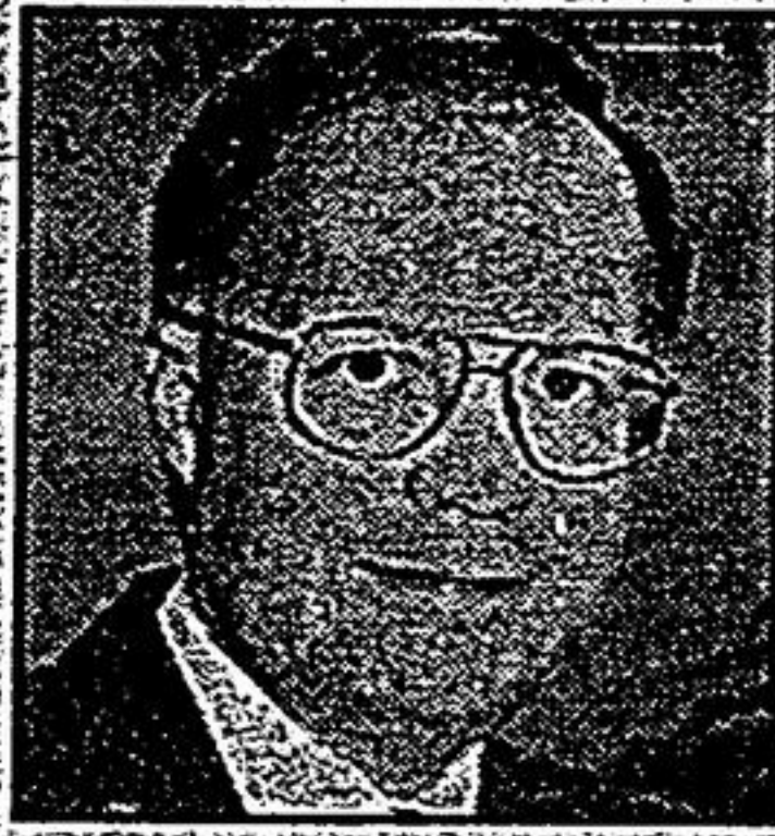
MP BRYON WILFERT

"This whole thing has turned into a bit of a circus and the House has suffered as a result," Wilfert said. "It's becoming a political game with the Reform Party wrapping themselves in the flag and saying that if you vote against their motion, you don't support the Canadian flag," he said.