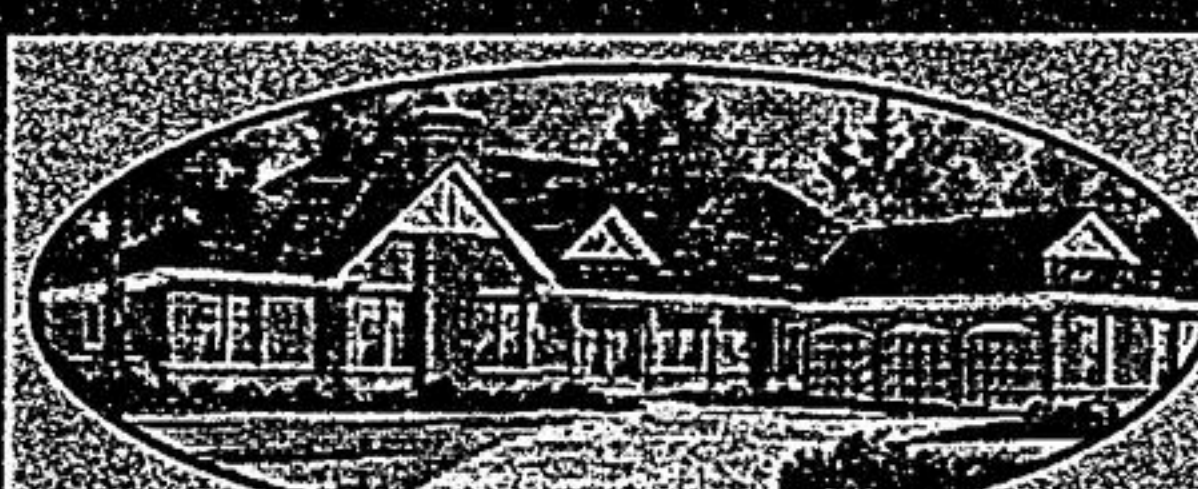
QUALITY "CUSTOM" BUNGALOWS AND 2 STOREY HOMES BUILT BY SCHICKEDANZ BROS. LTD.

CORPORATE CLIENT RELOCATING To Markham/Unionville, Stouffville area and wants me to find them 3-4 bedroom home. $250,000-$325,000. If You Are Thinking Of Selling Call Me Now for more information.