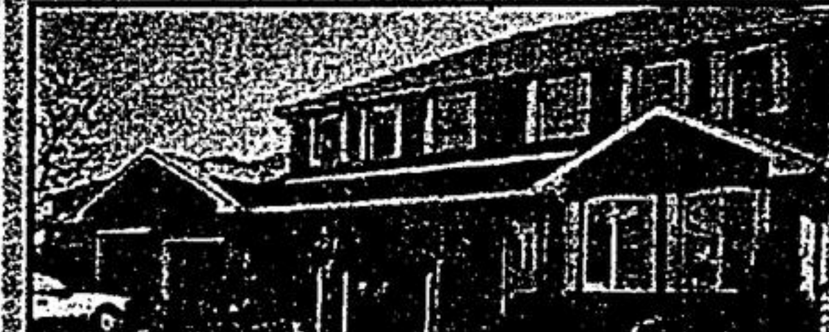
GORGEOUS ESTATE HOME IN SHARON (MINUTES NORTH OF NEWMARKET)

MUST SEE - 14 WOODMAN'S CHART Moving up or scaling down? You'll love this immaculate home on quiet cres. Walking distance to U. Main St. Beautifully upgraded hardwood flr, gas hp, A-10. Margo Hoover, 940-4180.