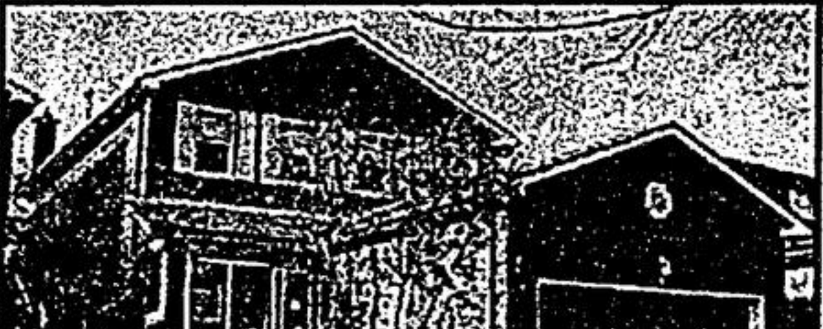
WANT THAT "WARM AND FUZZY FEELING?"

Home features the finest materials and craftsmanship. Custom fin. lower level. Separate entrance to main floor home office. Enjoy home spa, multiple fireplaces and very gracious living. For your viewing pleasure please call Inge R. Schickedanz, 940-4180.