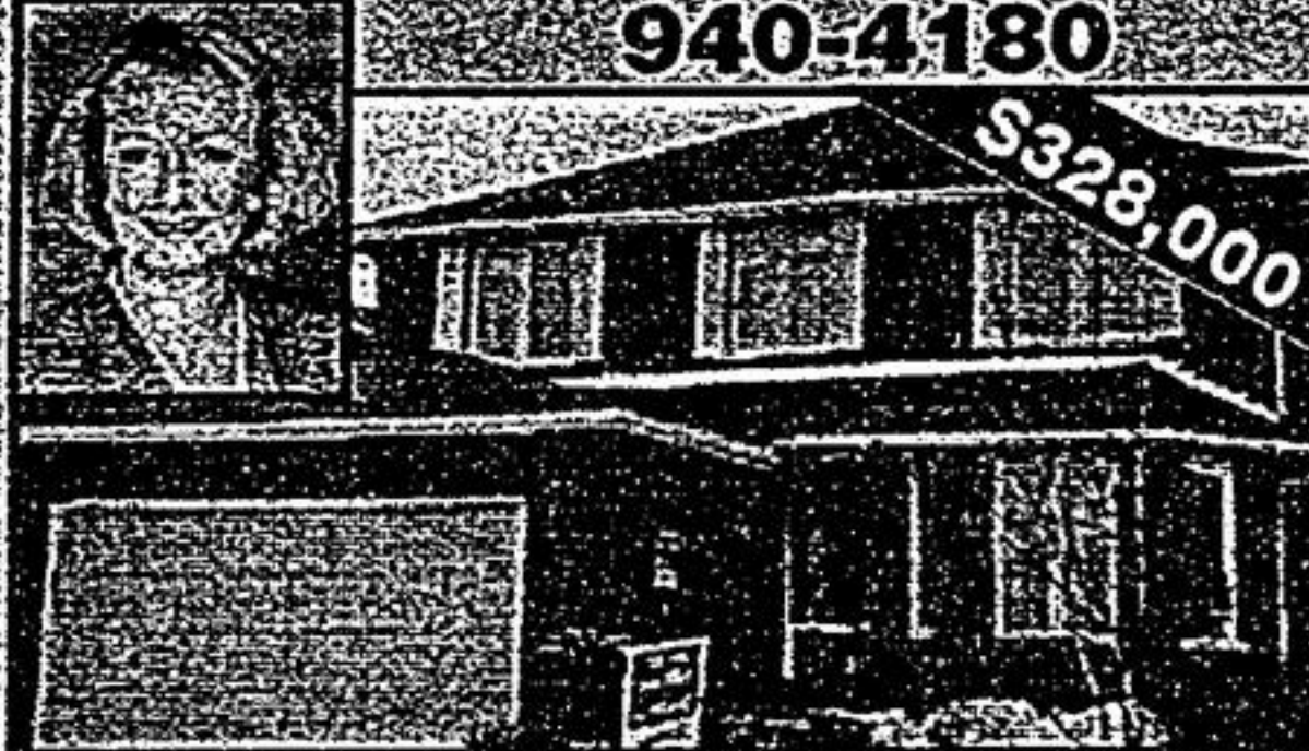
DONNA LINCOLN* 940-4180

PREMIUM LOT - QUIET CRES. $$$ in upgrades. 5 bdrms, 4 baths, 2 fireplaces, gorgeous kit. hrdwd. flrs., pro. fin. bsmt. w/in. l/p. bar. Fabulous condition. Call and ask for Donna Lincoln, 940-4180.