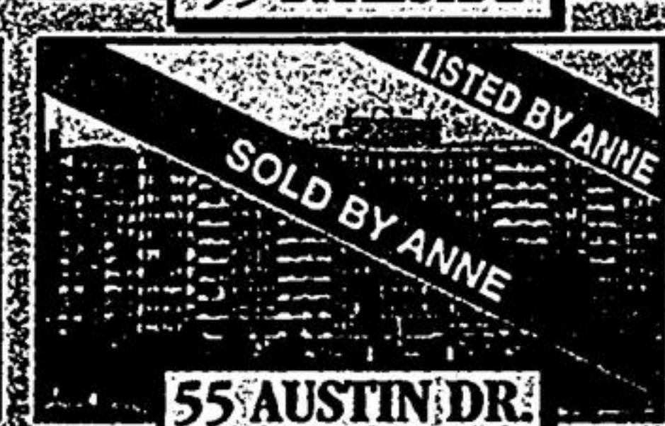
55 AUSTIN DR.