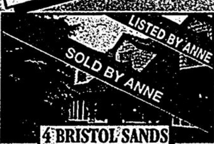
4 BRISTOL SANDS