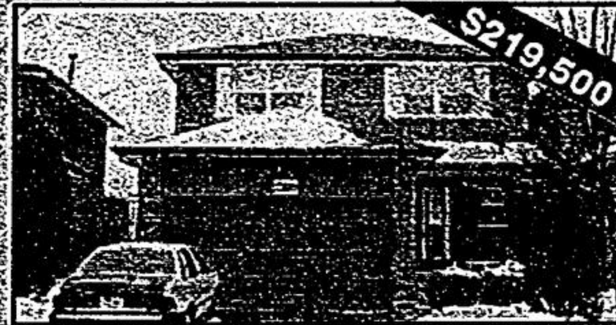
MARKHAM VILLAGE JUST REDUCED!