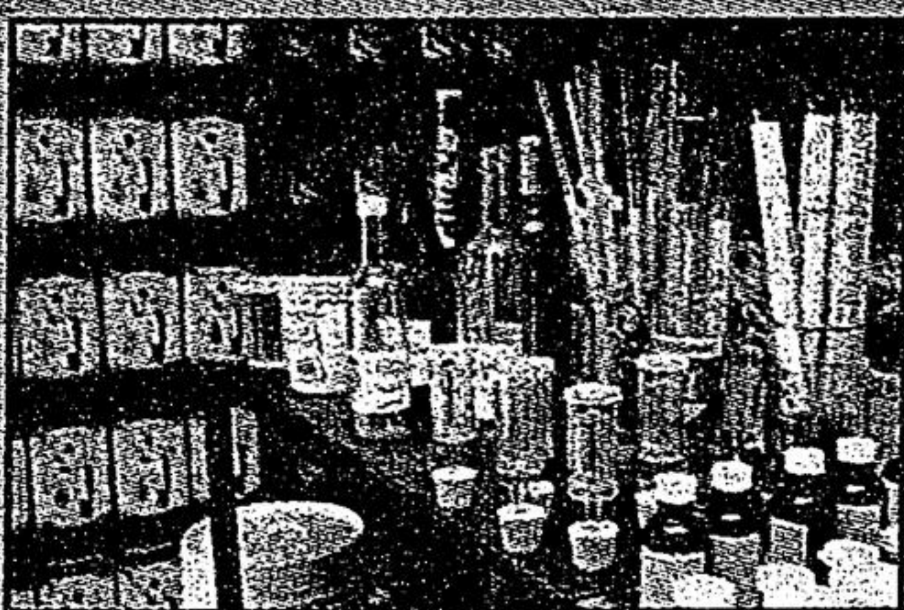
Vintner's Nook is now located at 109 Brock St. W. in Uxbridge.

The address has changed and so has the phone number, but the usual great service and wide variety of products still remains at Vintner's Nook in Uxbridge.