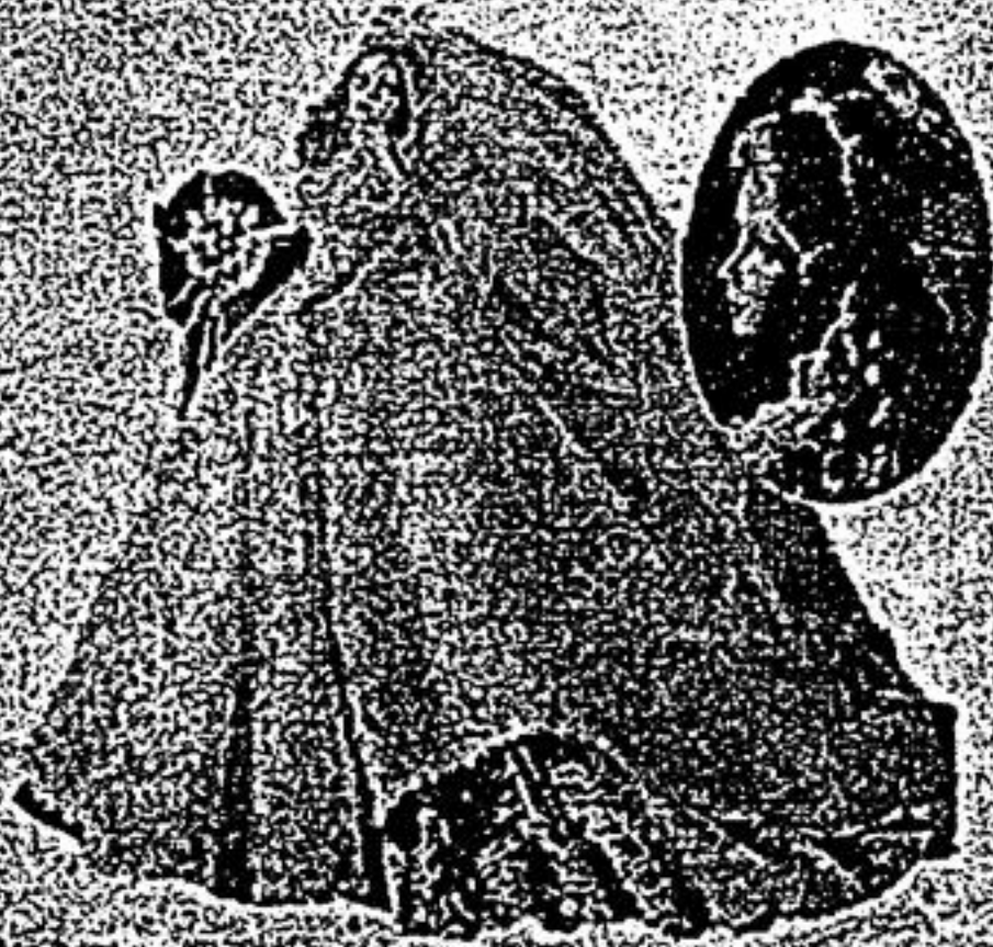
A breathtaking portrait of romance "Melody"