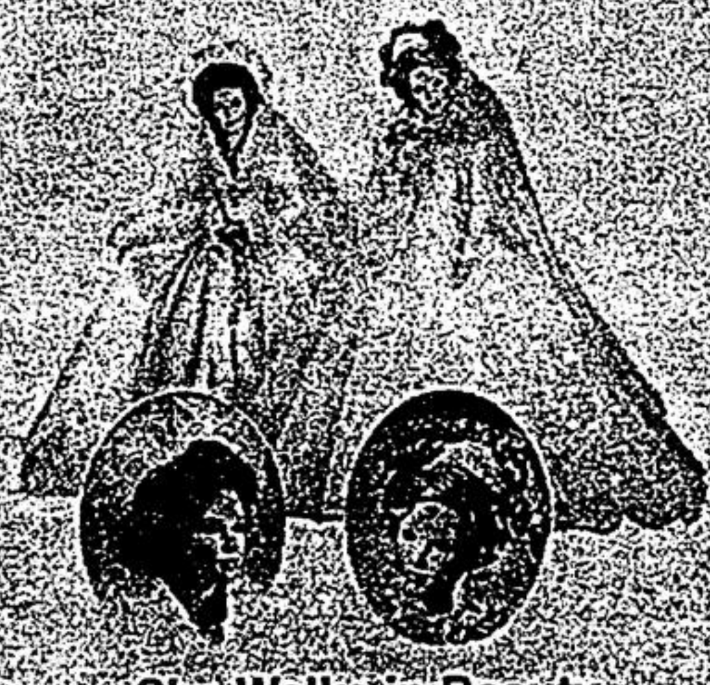
She Walks in Beauty "Winter Romance" and "Spring Promise"

12585 Tenth Line N., Stouffville (905) 642-3606