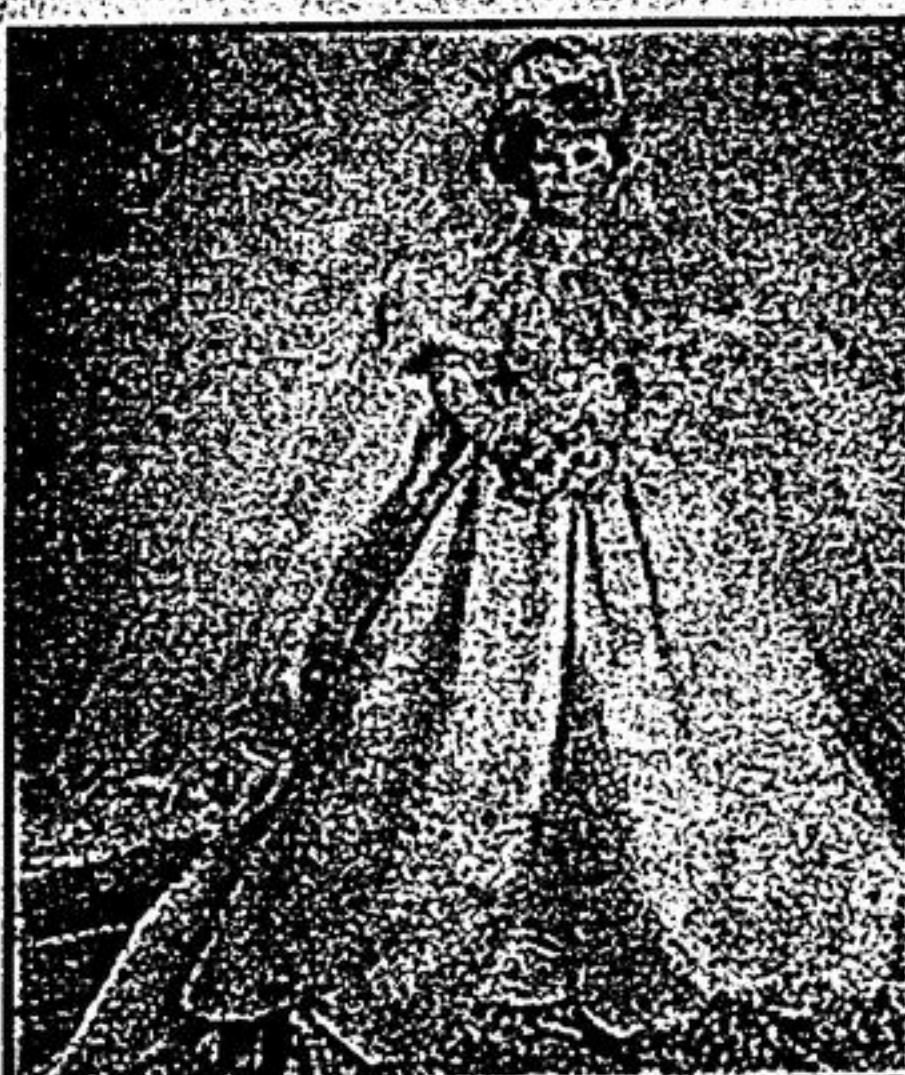
A doll that's sure to be a family treasure! "Lisa's 1990's Wedding Dress"