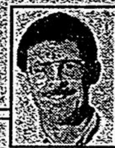
From Where I Live

Canadian eh? Oh, and if you're offering, I like my hot buttered rum spicy.