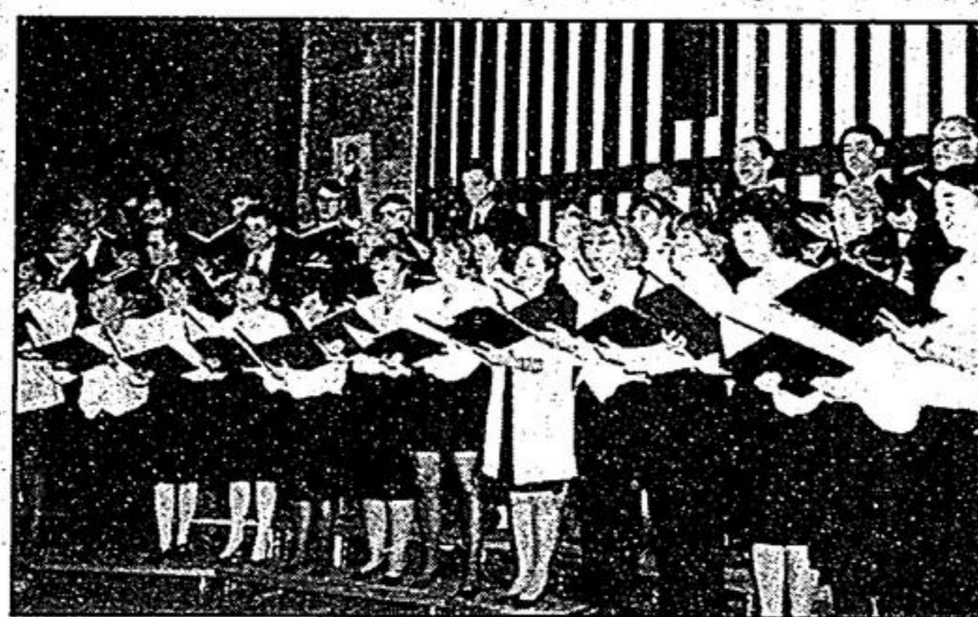
The Clock Tower Theatre Committee presented A Stouffville Christmas Concert and Carol Sing Dec. 21 at Christ Church Anglican.

Submissions to be sent to: Licensing and Permits Branch Liquor Licence Board of Ontario 55 Lake Shore Blvd. E., Toronto ON M5E 1A4 Fax: (416)326-5555 E-mail at licensing@llbo.on.ca.