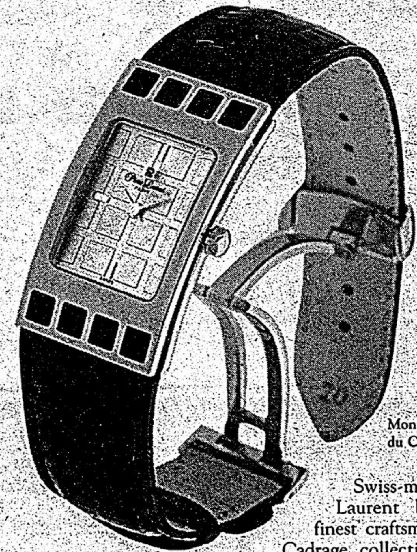
Montre Officielle du Cinema

Swiss-made Pierre Laurent boasts the finest craftsmanship. Its Cadrage collection won a coveted award from The French Watch Manufacturer's Association and the Cannes Film Festival for design excellence. It was also the official watch to commemorate the 100th anniversary of the film industry. The 'Cadran D'or' award signifies exceptional quality and an endorsement for its excellence.