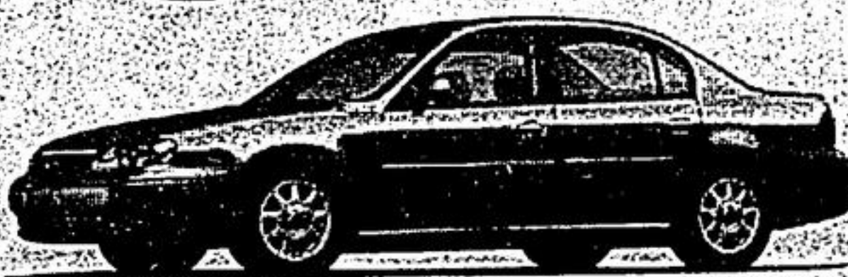
MALIBU 4 to choose from

2.9%* up to 48 mths on selected vehicles