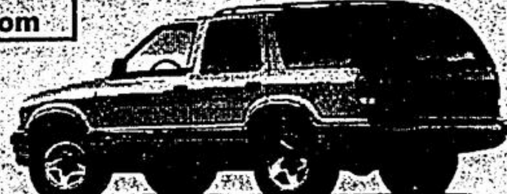
BLAZER 1 only