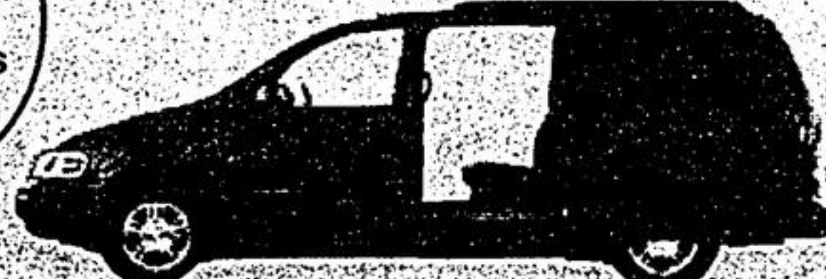
VENTURE 2 to choose from

4.9%* up to 60 mths on selected vehicles