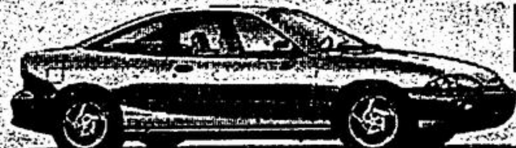
CAVALIER 6 to choose from