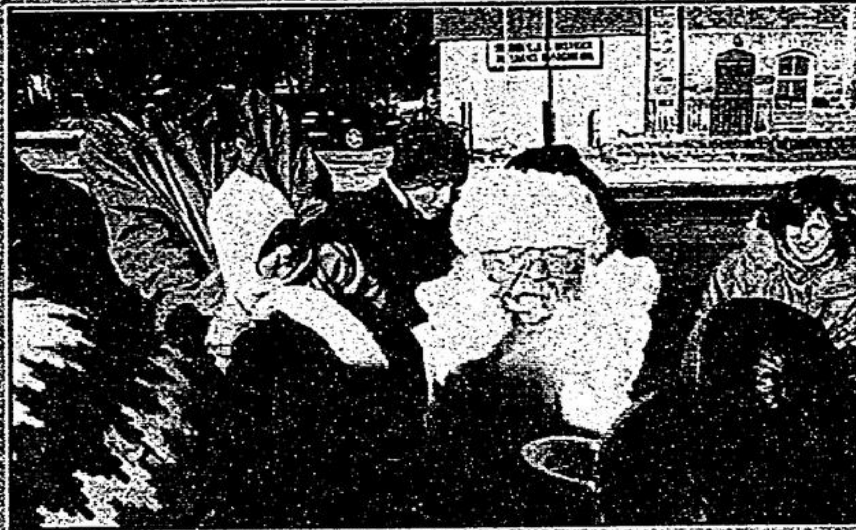
(Left) Everyone is invited to come out to the pancake breakfast on Saturday. Santa will be there enjoying freshly-made pancakes with lots of syrup.

Hot chocolate and cookies will also be served.