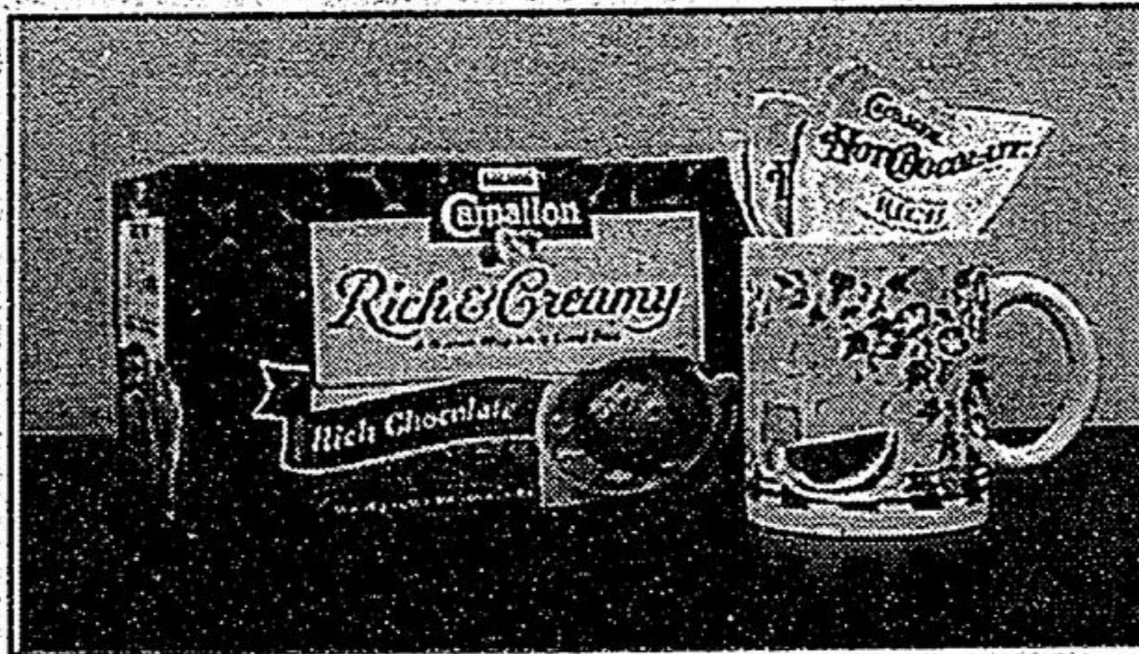
A nice mug and a jumbo box of hot chocolate will keep any chocolate lover happy.

And if the person on your list loves photos, you can make your own calendar.