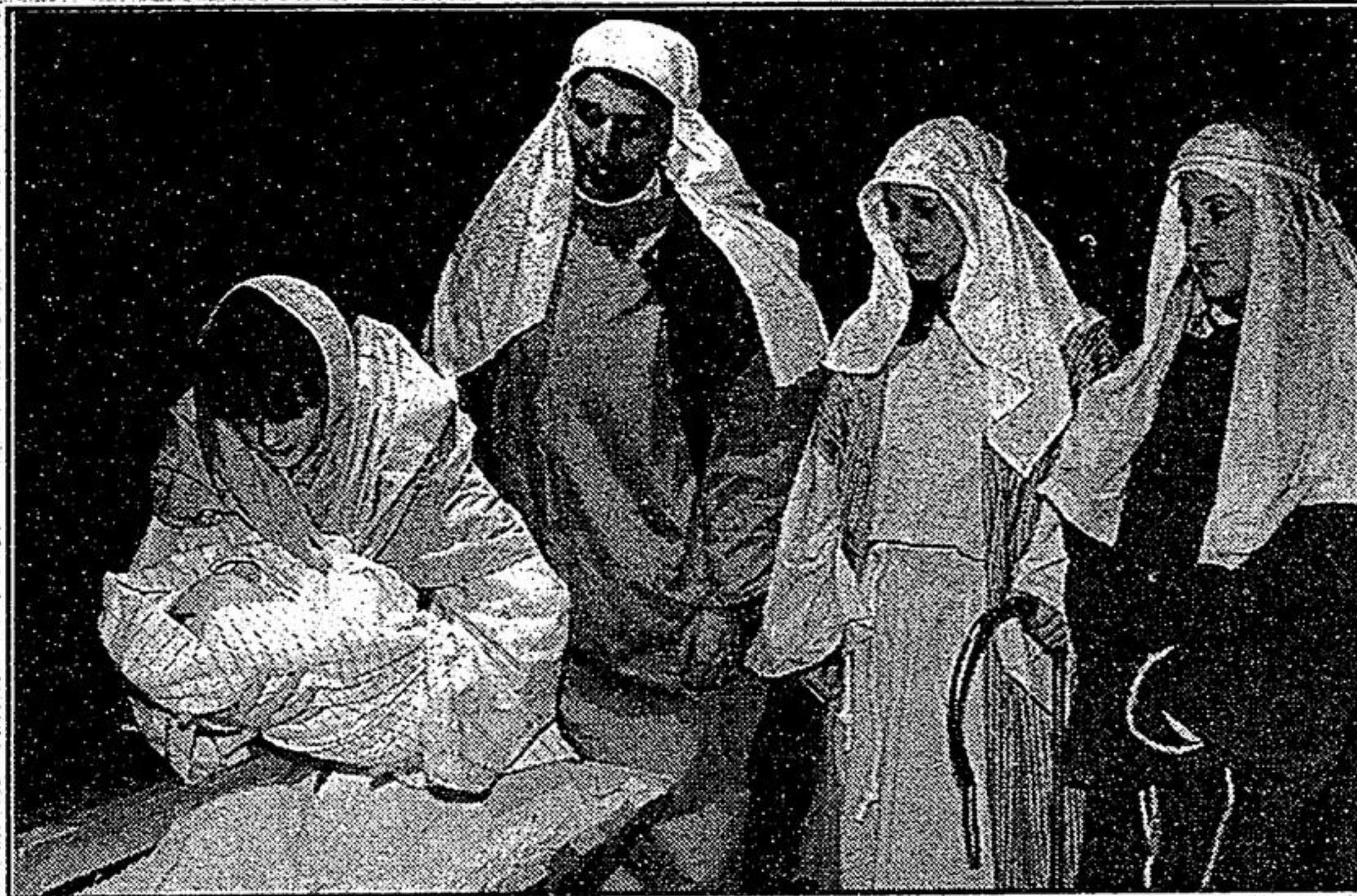
Twelve babies and their parents were used to re-enact the trip to Bethlehem.

Every attempt is made to take participants out of the 20th century to get the feel of actually being in the