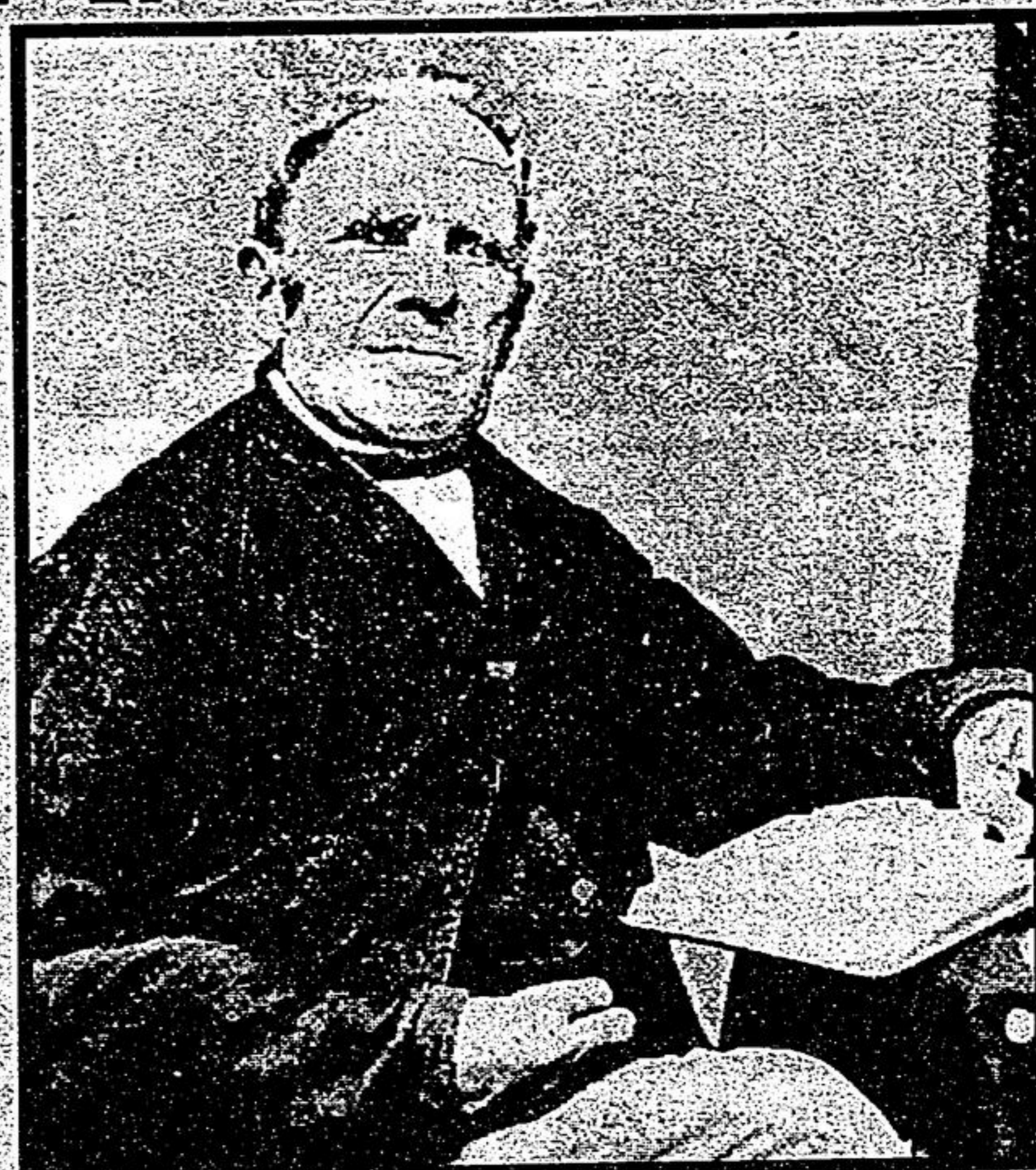
Stouffville Bank Manager says sell the kids!