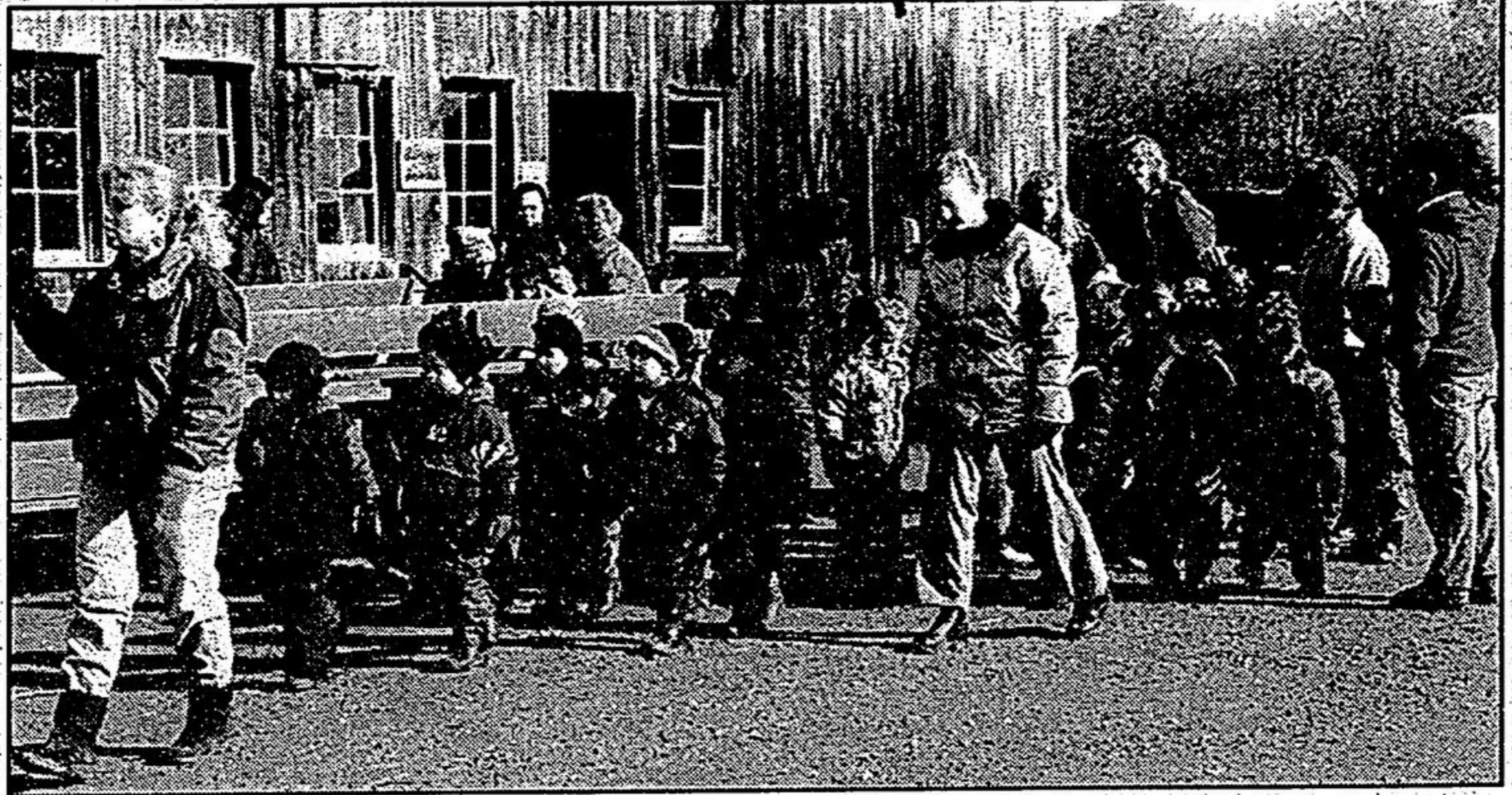
Willowgrove Farm day camp in Stouffville opened doors this week to provide programs for kids stranded by the closure of schools. On the first day more than 30 children were registered, enjoying outdoor education, pony rides and academics.