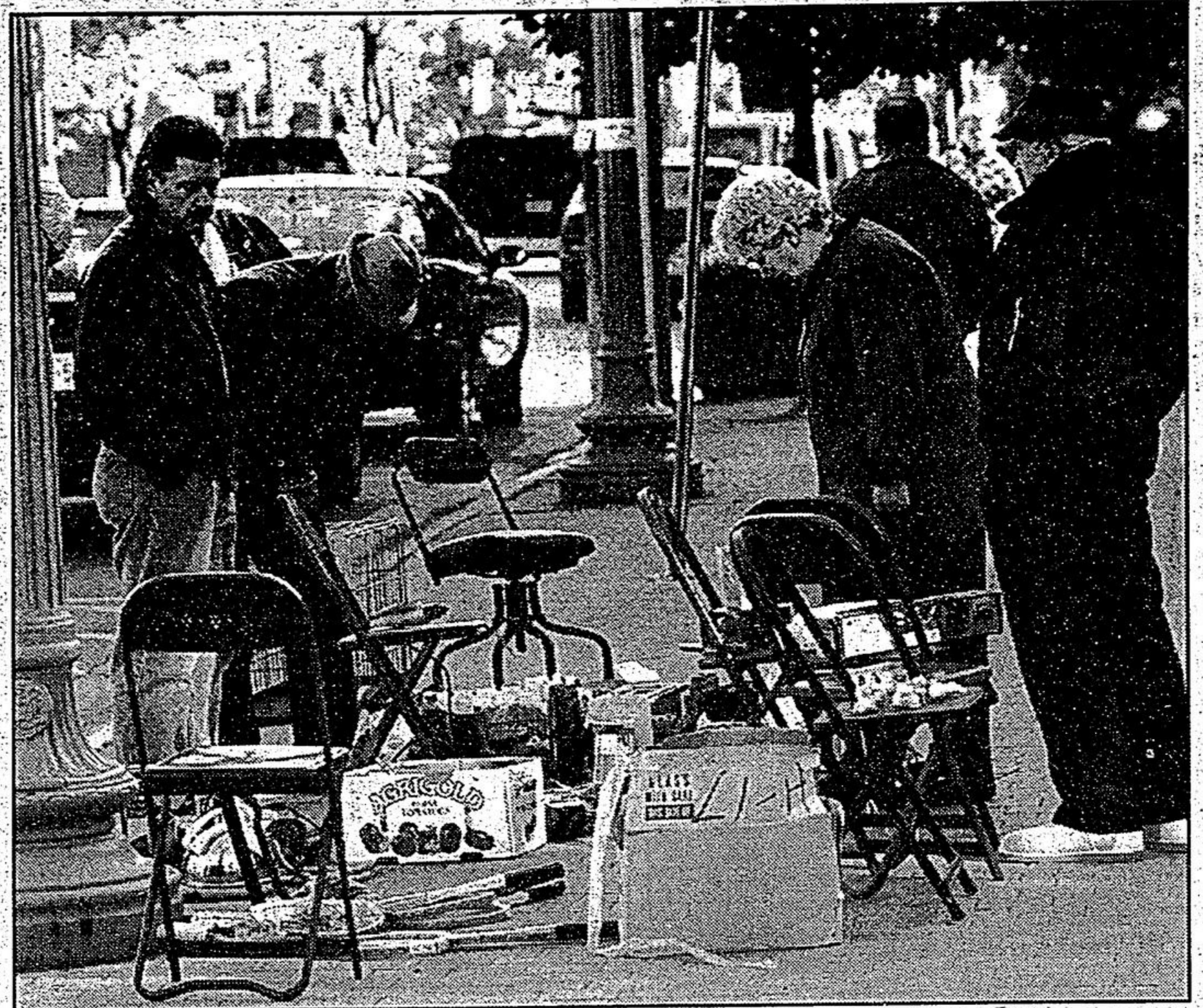
BARGAINS GALORE: Customers check the early sales at the Stouffville Main Street garage sale sponsored by the B.I.A last week.